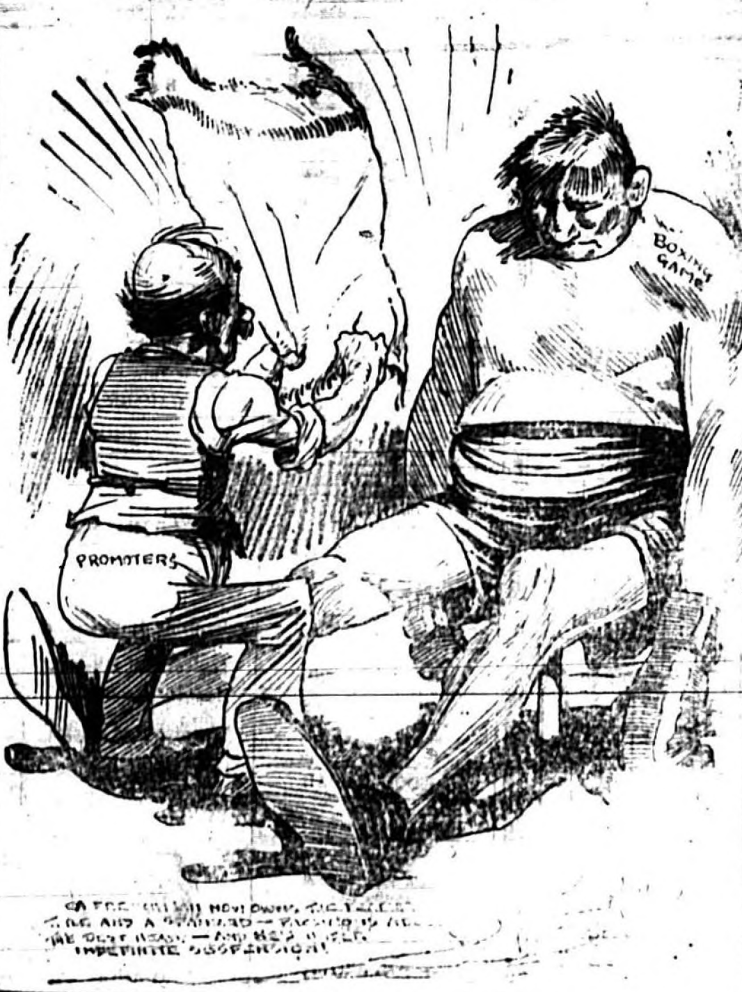
THE MAN WHO PROMOTES BOXING IS IN A BAD WAY!