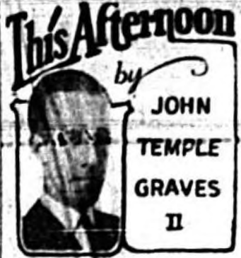
This Afternoon by JOHN TEMPLE GRAVES II