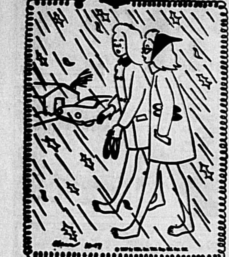
"Why would he be a dentist. He'd like a career... could stick his teeth into."