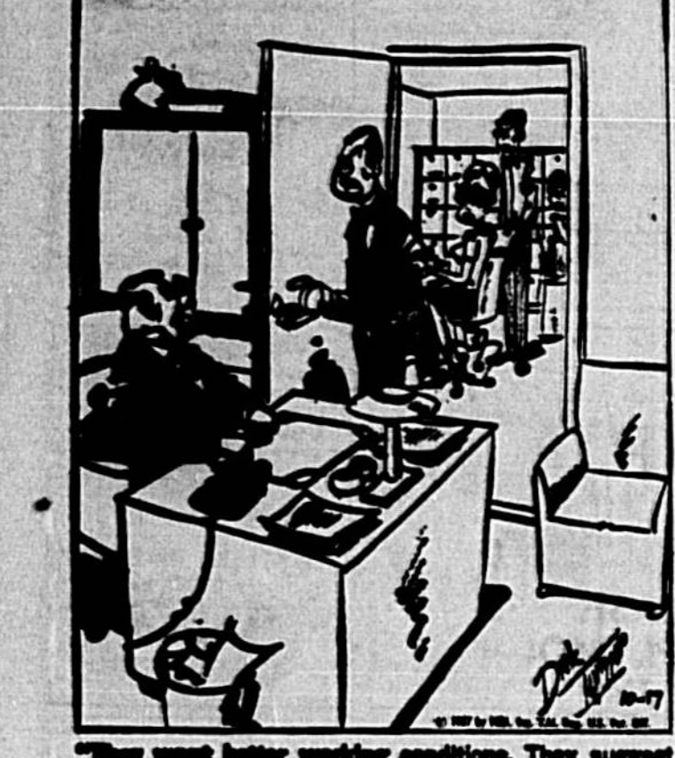
"They want better working conditions. They suggest... can start by not keeping your door open."