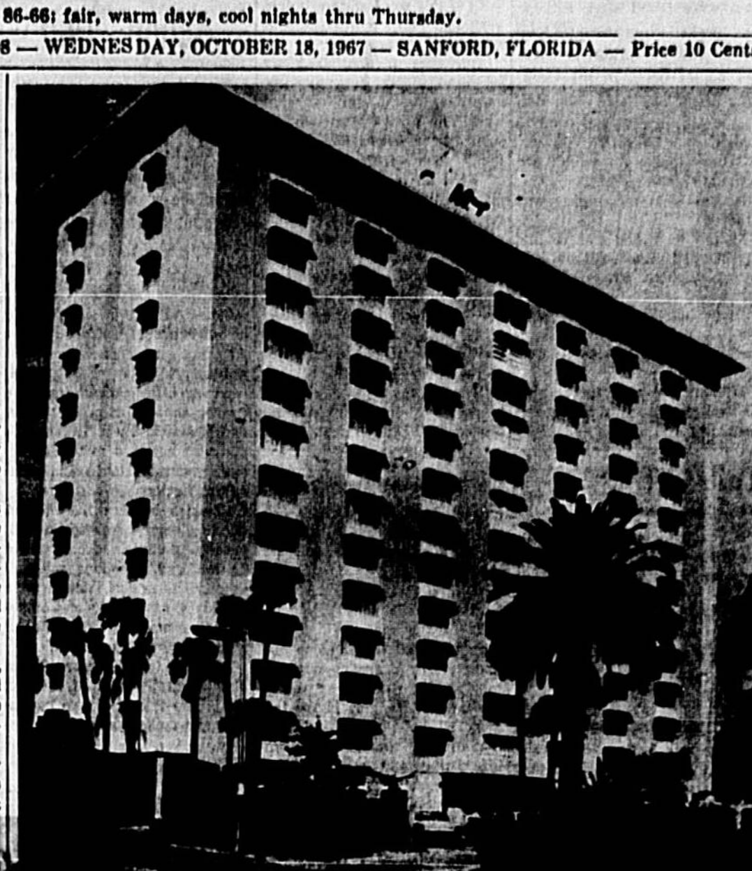
THIS IS A VIEW OF THE Magnolia Towers, an apartment constructed in Orlando by the developers - the General Guaranty Mortgage Co. - now considering the erection of such an apartment in downtown Sanford.