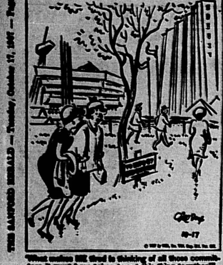
First woman she tried to think of all those combs... can't have them to put this thing together.