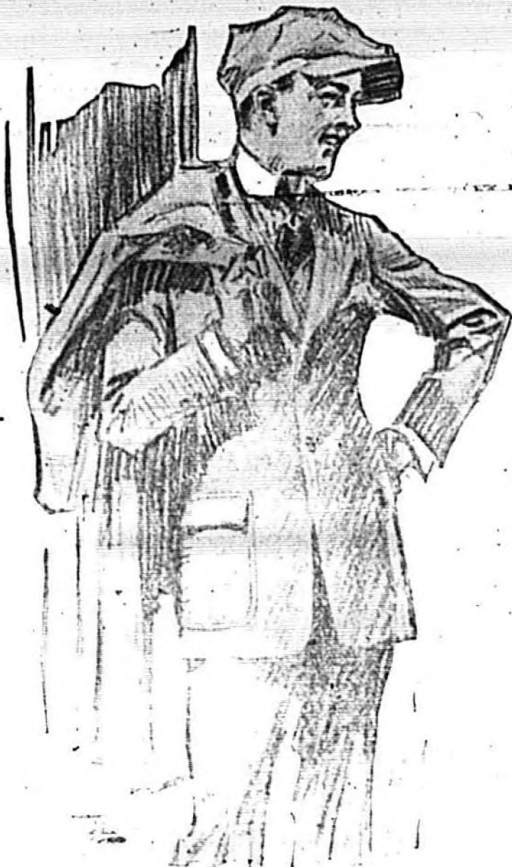
Copyright 1918 Hart Schaffner & Marx