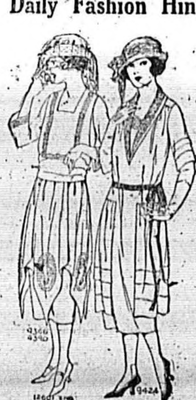
FASHIONED WITH RARE GOOD TASTE

The distinguishing characteristic of the handsome frock to the left is the embroidery in chenille and beads which trims the panelled skirt and waist. Fuchsia Georgette crepe is the material employed in its development. The front of the long-waisted blouse is laid in plaits at the under-arm edges, while the neck is in square outline. Flare sleeves are attached to the under-body. There are five papels on the body. There are five panels on the skirt. Medium size requires 534 yards