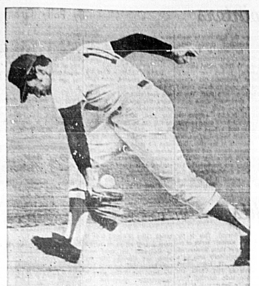
NO SPRING CHICKEN but still not gone to bed. Boston shortstop Luis Aparicio, of the American League All-Star shortstop, still goes by his right better than the average 27-year-old.