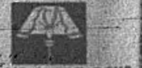
THE NO-GLARE BOWL In the new lamps, a glass diffusing bowl softens a rather harsh light.