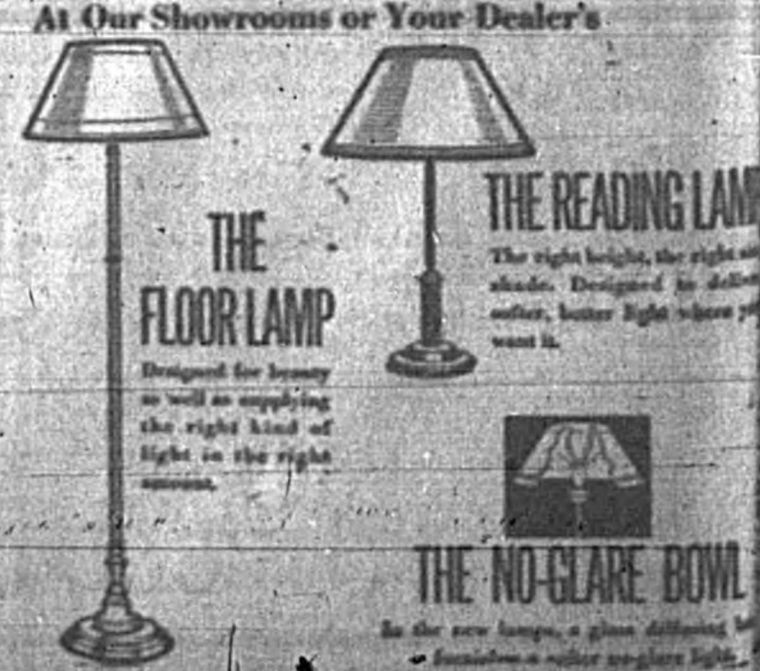
THE FLOOR LAMP Designed for beauty as well as supplying the right kind of light in the right amount.