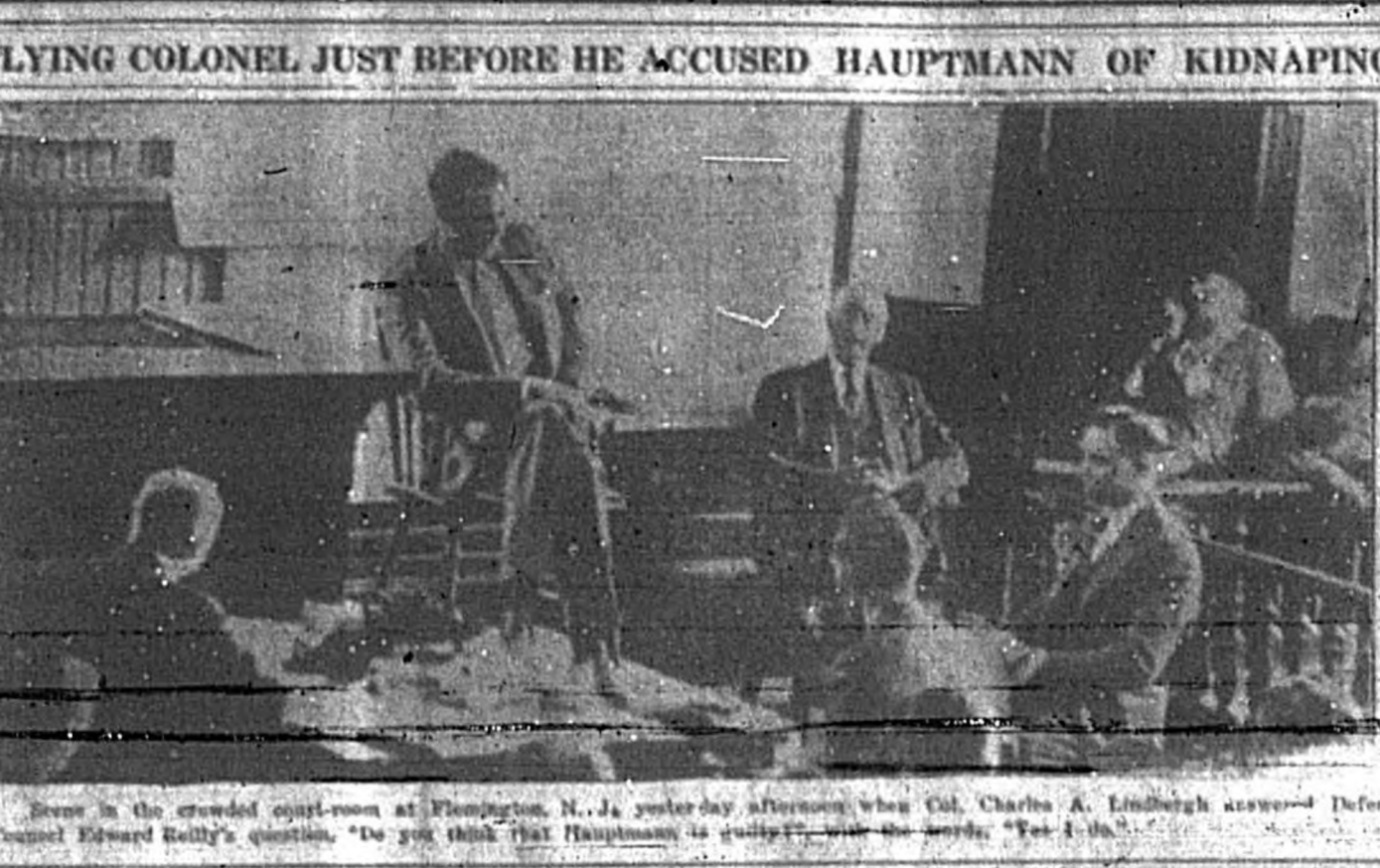
FLYING COLONEL JUST BEFORE HE ACCUSED HAUPTMANN OF KIDNAPING Here is the crowded courtroom at Homestead, N. D., yesterday afternoon when Col. Charles A. Lindbergh accused Defense Counsel Edward Hauptmann, the man who is charged with the kidnaping of the "Boy in the Clouds," of kidnaping the boy.

Oil Industry Leads Revolt Against Long NEW ORLEANS, Jan. 7.—(AP)—The oil industry has led a revolt against the Long family in Louisiana. The industry has been protesting against the Long family's control of the state's oil resources. The Long family has been accused of favoring their own interests over those of the state.