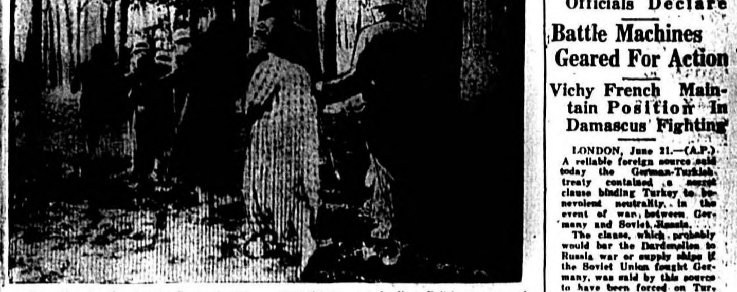
According to the British Press Service, executioners and leading Polish women out this photo shows German soldiers acting as to be shot in the woods of Palmiry.

Nazi Executioners Lead Polish Women To Doom