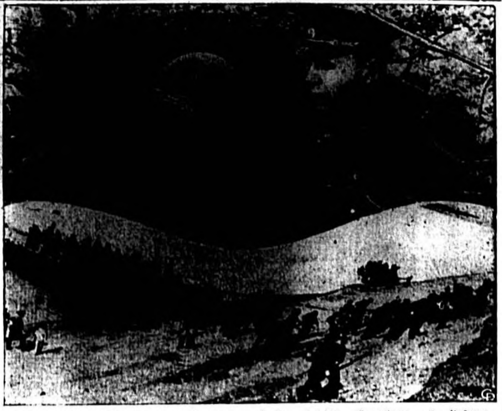
These photos of the Red Army in maneuvers arrived in the U. S. at a time when friction between Russia and Germany is reported to have brought those countries to a crisis.

WASHINGTON, June 23 (AP)—The United States condemned Germany's "treacherous attack" on Russia and declared "any rallying of the forces opposing Hitlerism would rebound to the benefit of American defense and security."