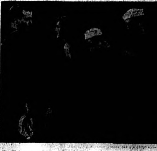
NO EXPLANATION is offered as to how they accomplished it, but Abbot and Costello who were seen here recently in "Buck Privates" will appear at the Ritz theater next Wednesday and Thursday in "In The Navy," with Dick Powell, Claire Dodd and the Andrews Sisters.