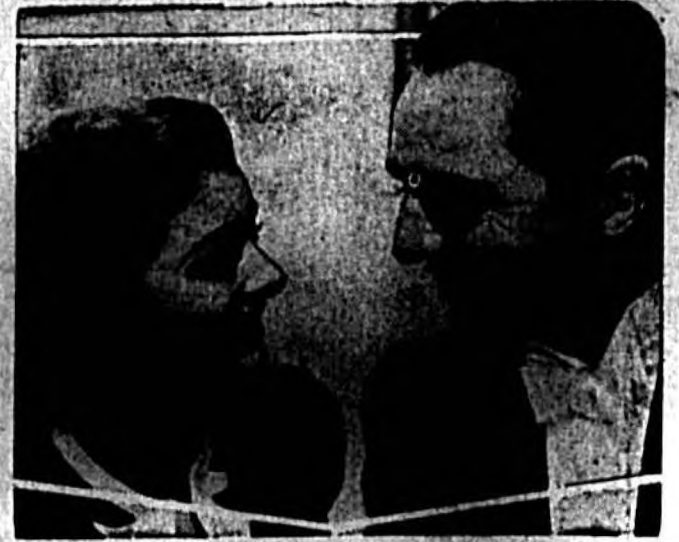
THE SCREEN'S daffiest "Mr. and Mrs." team, Myrna Loy and William Powell, romp through the merriest matrimonial misadventure of their hilarious career in "Love Crazy" which will be shown tomorrow and Monday at the local Ritz.

Saturday, Midnight Show 11:30 Tonight—"THE INVINCIBLE WOMAN" with John Barrymore, Virginia Bruce and Charlie Ruggles. Also—Cartoon, Comedy, Novelty and Community Song Real. Sunday, Monday—"LOVE CRAZY" with William Powell, Myrna Loy, Gail Patrick and Sara Haden. Also Walt Disney Cartoon "GENTLEMAN'S GENTLEMAN" and Metro News. Tuesday, Bargain Day, Double Program—"THEY MET IN ARGENTINA" with Maureen O'Hara and James Ellison. Also—repeat showings "LILLIAN RUSSELL" with Alice Faye, Don Ameche, Henry Fonda and Edward Arnold. Wednesday, Thursday—"IN THE NAVY" with Abbott and Costello, Dick Powell, Claire Dodd, The Andrews Sisters and Dick Foran. Also—Comedy, Novelty and News. Friday, Saturday—"PONY POST" with Johnny Mack Brown, Fuzzy Knight, and Nell O'Day. Also—"MELODY AND MOONLIGHT" with Johnny Downs, Vera Vague, Jerry Colonna and Mary Lee.