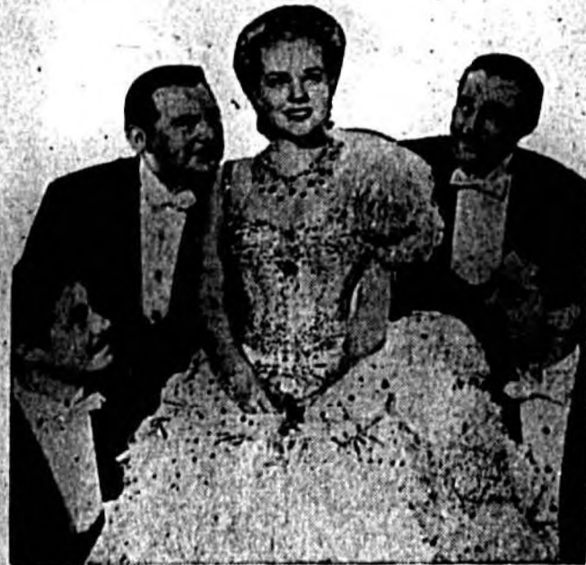
ONE OF the big hits of just a few years ago, "Lillian Russell," with Don Ameche, Edward Arnold, Alice Faye, Warren William and Henry Fonda, will be the "returned favorite" to be shown as part of a popular Bargain Day Program at the Ritz, next Tuesday.