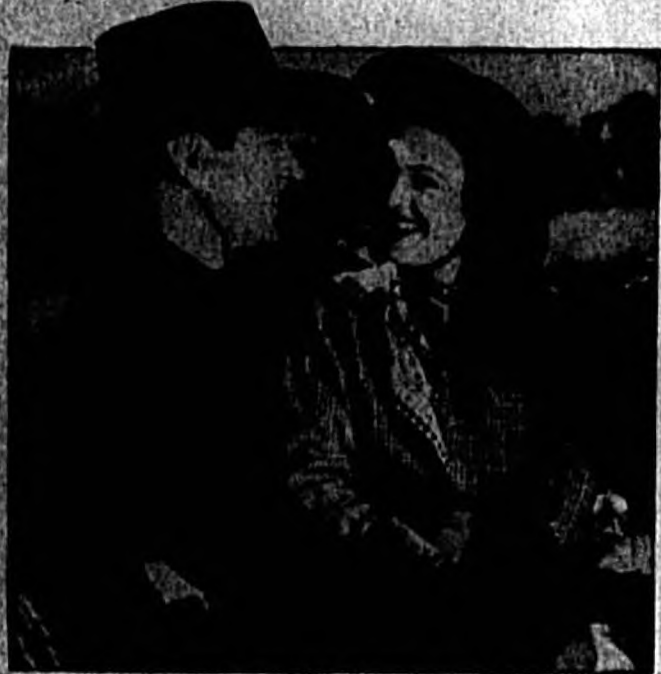
JOHNNY MACK BROWN, sturdy son of Alabama who has more than made good in Hollywood, will be seen in "Pony Post" at the Ritz next Friday and Saturday. Fuzzy Knight, Nell O'Day and Jimmy Wakeley and his Rough Riders are in support.