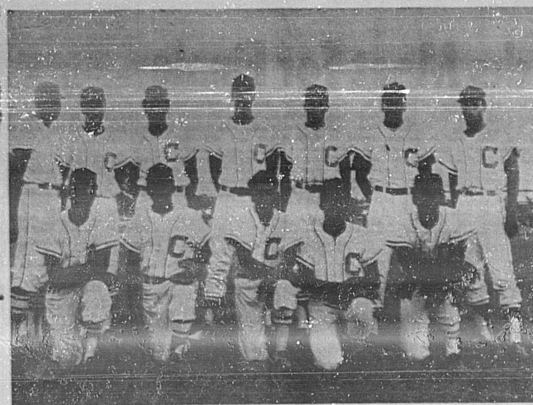
CROOMS HIGH SCHOOL 1970 BASEBALL TEAM