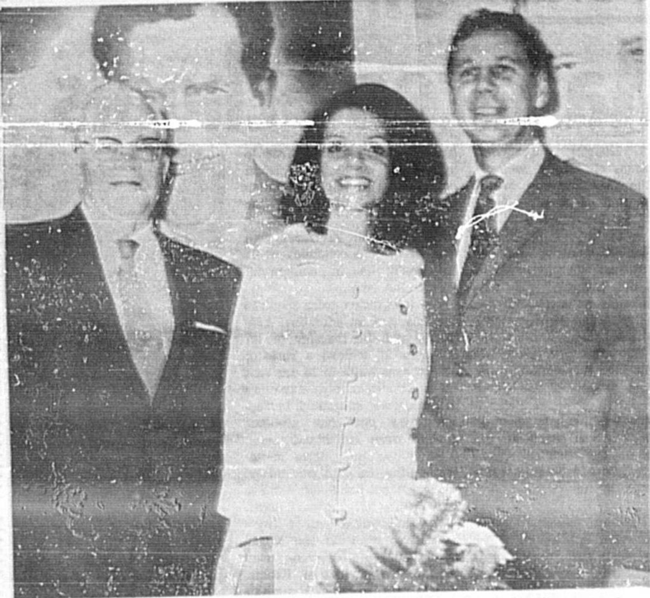
NEW SEMINOLE County Republican Headquarters was officially opened Thursday afternoon on SR 436 in Altamonte Springs with party "VIP's" on the looker room has turned his three-questioning talents to the bar room with a beer he says will eliminate hangovers.