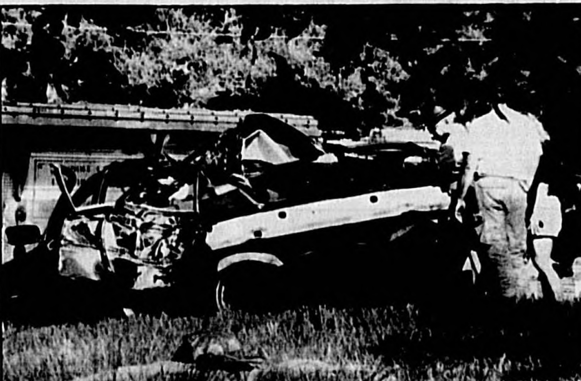
Emergency personnel examine the demolished BMW that slammed into a tree killing two teen-age girls.