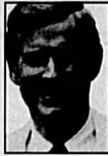
Dr. Peter Gott