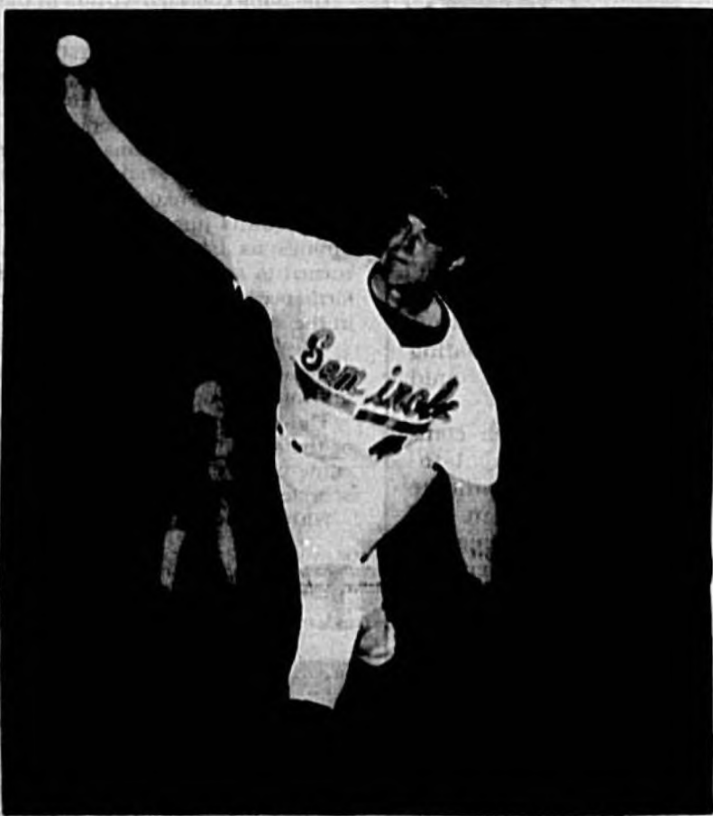
DIFonso as the only players who will be to old to play for the Sanford American Legion Campbell-Lossing Post 53 team next summer.