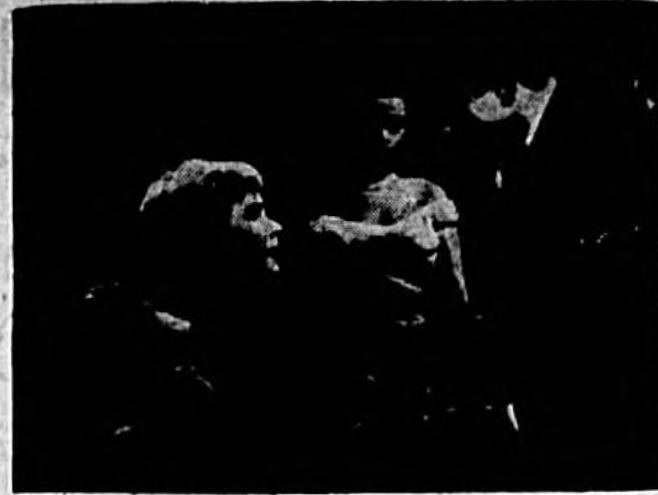
CAREER-CONSCIOUS Anthony Franciosa turns his charms on the producer's daughter, Shirley Maclaine, while his wife, Joan Blackman, observes in the background in this scene from "Career" which arrives at the Movieland Drive-In Sunday.

The new Torresdale plant, with a capacity of 423 million gallons daily, is the major unit of a 30-million-dollar program to modernize Philadelphia's water purification facilities.