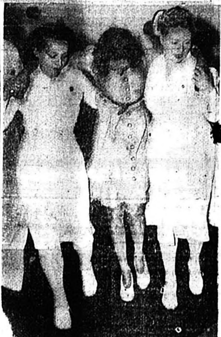
TWO NURSES come to the aid of a woman, one of the hundred or more persons seriously injured when an Army B-25 crashed into the 70th floor of the Empire State building, turning the giant's turret into a flaming torch.