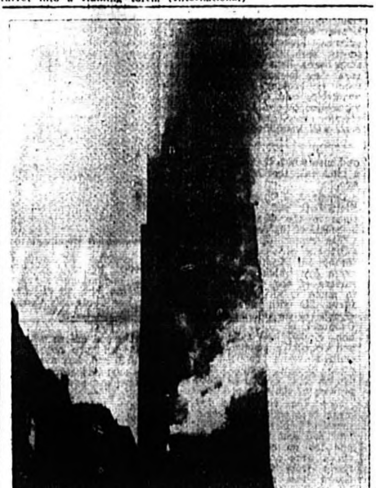
SMOKE CAN BE SEEN POURING from the top of the Empire State building tower following the crash of a B-25 Army Bomber against the 102 story building. Flaming gasoline from the exploding bomber turned the upper stories into a pillar of flames.

ships cruisers and destroyers pumped more than 1,000 tons of shells into industrial installations at Hamanatsu, on the south coast of Honshu, Hamanatsu, a city of 165,000, had been hit hard before by Superfortresses which destroyed 1.25 square miles of 70 per cent of the city. It was last bombed on June 13.