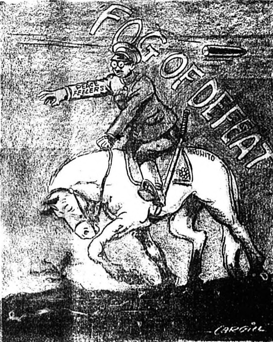
Illustration by Cargill

In the five years following the World War I price collapse, 400,000 U. S. businesses failed. The average U. S. farm income shrank from $1500 in 1919 to $400 in 1921.