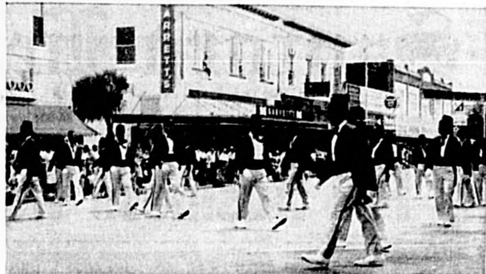
THE PRECISION marching team of the Shriners is shown in the top photo during the Shrine parade Saturday in downtown Sanford. The bottom photo shows the candidates for initiation holding onto a rope. This also was taken during the parade by the 5,000 Shriners who met here Friday and Saturday.

It is a violation of game laws to shoot or attempt to shoot any game from a vehicle in many states.