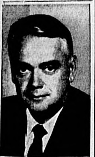
McCanna Against Intangible Tax

(Written for NEA) If you follow one simple direction, this test will actually give you a good review of the columns to date. The direction: DO NOT SKIP ANY STATEMENTS in your circling them as true (T) or false (F).