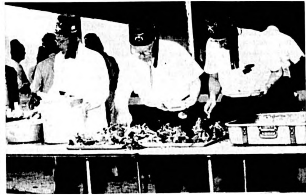
FEEDING OF 4,000 Shriners Saturday was some job and this picture shows a part of the line of hungry Nobles filling their plates with luscious barbecue and the trimmings that went with it.