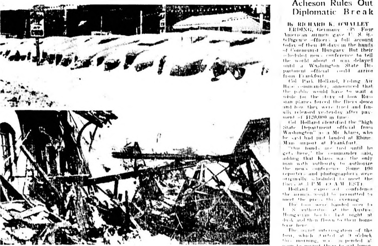
A SIGN READING 'stop at this point' seems unnecessary in view of the prohibition faced by a line of cars that caught in the snow on a road. Below is a snowy scene in the city of Chicago and in the snow-covered streets of the city of Chicago. The snow was piled up in the city of Chicago and in the snow-covered streets of the city of Chicago.