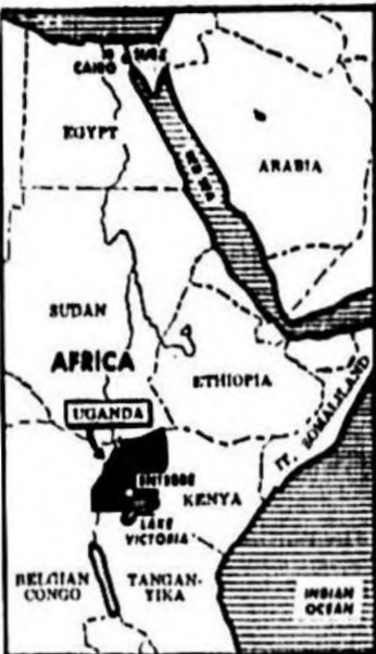
CAPABLE of handling the latest jet planes on two-mile runways, the new British air base at Entebbe, Uganda (black), is only 250 miles south of the Sudan, whose rule by the British is disputed by Egypt. Entebbe affords Britain an air base strategic to the rest of the Middle East as well.