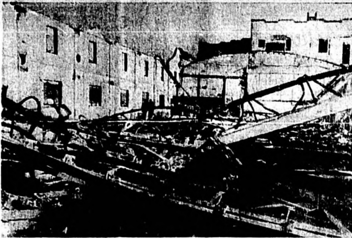
THIS TWISTED WRECKAGE IS ALL THAT REMAINS of the Old Coliseum in Tijuana, Mexico, after a fire roared through the five-story building during a Christmas party, killing at least 34 persons and injuring about a hundred more. Many were trampled in the rush to escape as the scene of pre-Christmas gaiety turned into one of horror. The fire started shortly after midnight when a Yule tree was knocked over in a scuffle by two celebrators on the third floor of the iron-roofed concrete and wood structure.

Archie Wilson of the Buffalo Bisons led the International League in '51 in runs-batted-in, total bases and hits. He is property of the Yankees.