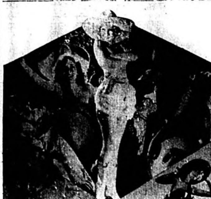
The Ziegfeld chorus with Eddie Cantor in "Whoopee"

Seen above are some of the scores of beautiful girls who will appear at the Milane Theater tonight in a return engagement of Eddie Cantor's outstanding musical success, "Whoopee". Elaborate staging is brilliantly reproduced in this film which is all in Technicolor, and Mr. Cantor and a gang of popular players score a distinct hit in the start of the film.