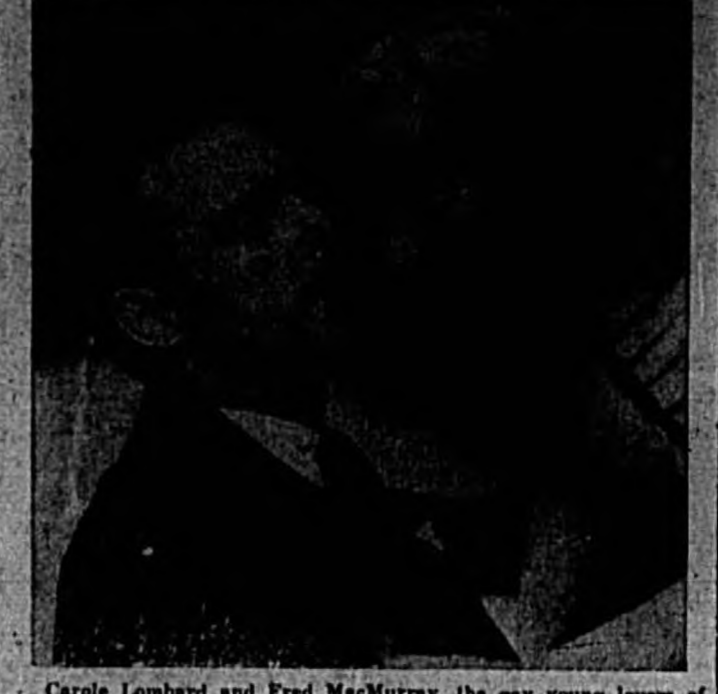
Carol Lombard and Fred MacMurray, the gay young lovers of the sensationally successful "The Princess Comes Across," "Hands Across the Table" and "Swing High, Swing Low," are teamed together again in "True Confession," new comedy-drama which opens Tuesday at the Ritz Theater, with John Barrymore co-starring with them.