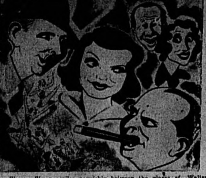
Simone Simon smiles roguishly between the glares of Walter Winchell (upper left) and Ben Bernie (with the big cheroot). The trio is starred in Darryl F. Zanuck's great new idea musical show, "Love and Hises."