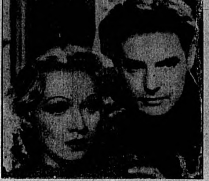
Marlene Dietrich and Robert Donat as the lady in distress and the modern-day knight who comes to her rescue in "Knight Without Armor," the Alexander Korda production of the famous James Hilton love story which comes to the Ritz Theatre Friday.