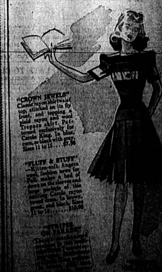
"CROWN JEWELS" Classic rayon shirtwaist top, stitched on its fly front, and topping a plaid rayon and wool trepacs skirt. Patterned exclusively for Carole King. In blue, coral, or black with grey. Sizes 11 to 15... $7.98 "FLUFF & STUFF" Kitten-toft Angora wool fashion news for fall makes a bed of down on the sleeves and large patches of this smiling Carole rayon trend down in brown, green, and black. Size 11 to 15... $10.95 "STRIPES OF PARADISE" Thinly seamed... $10.95