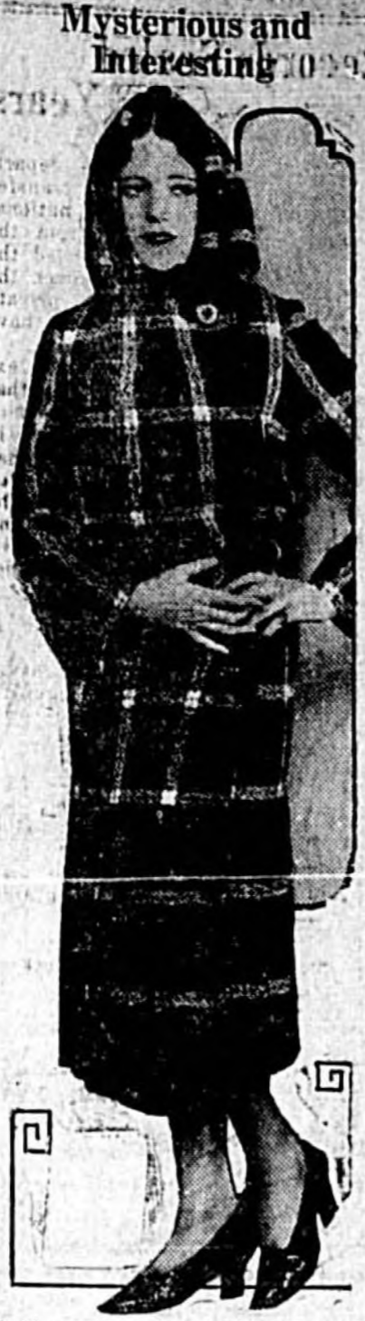
Mysterious and Interesting

"There may be enough roofs today to cover every citizen of our nation, and enough floor area in which to transact all business of the country," he said, "but building on a large scale will go on just the same.