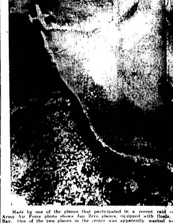
Made by one of the planes that participated in a recent raid on Attu in the Aleutians...