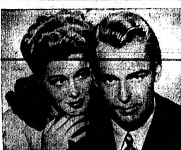
TOUGH GUY ALAN LADD is not only a two-gun man, he's a two woman man! In Paramount's spy thriller, "Lucky Jordan," shown today and Thursday at the Ritz Theater, he makes love to the blonde duo, Helen Walker and Marie McDonald.