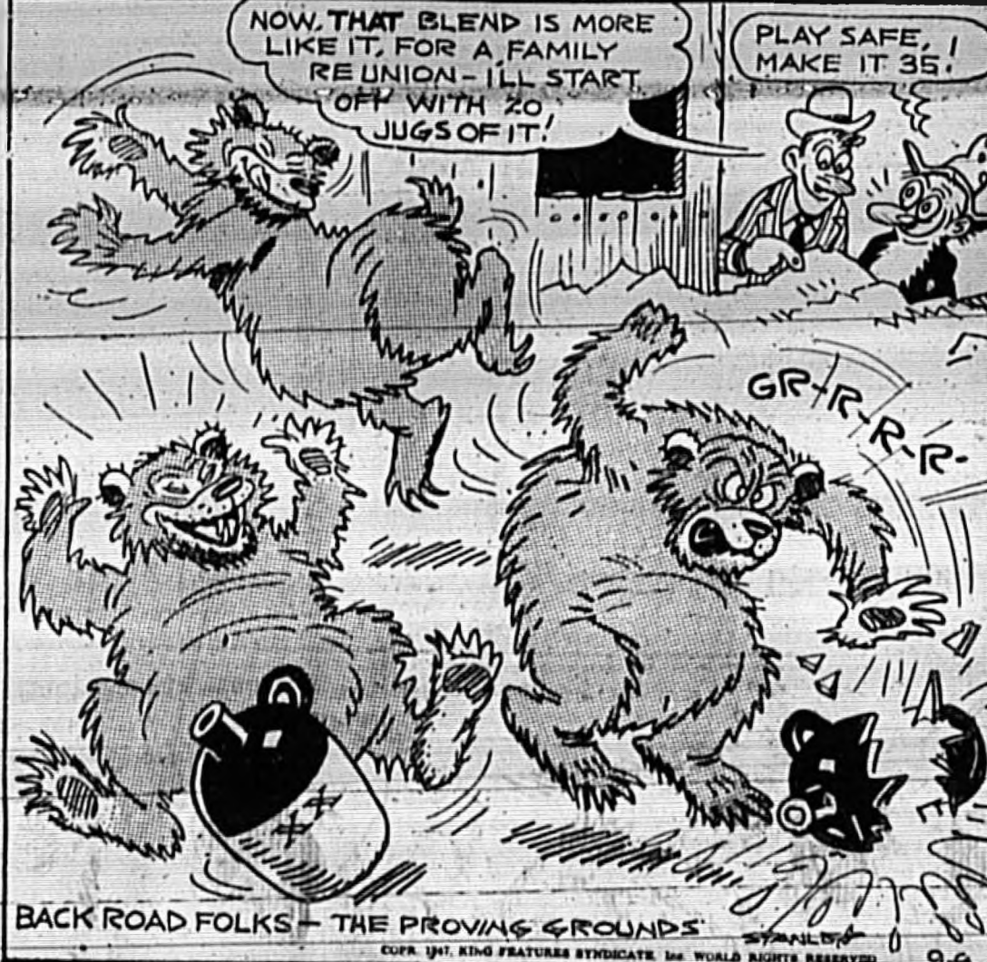
BACK ROAD FOLKS - THE PROVING GROUNDS