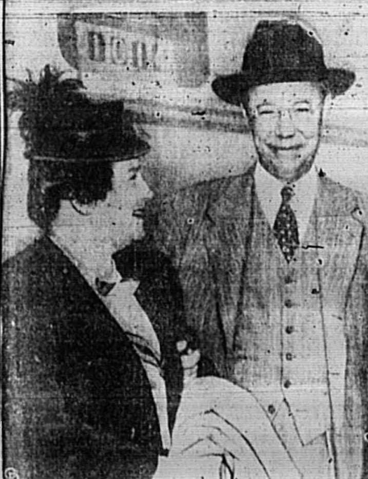
REGARDED AS A TOP-FLIGHT POSSIBILITY for the Republican presidential nomination, Sen. Robert A. Taft (R-Ohio), and his wife are shown on their arrival at Berkeley, Calif. He will address the State Bar Association Oct. 15 at the University of California.

Commission records reveal that throughout the state 47 persons were convicted on game law charges since the close of last hunting season.