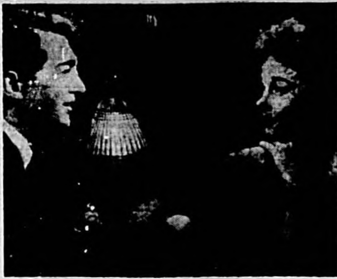
DEAN MARTIN and Susan Hayward in a scene from "Ada" coming to the Ritz Theatre Sunday.

DEAR OLD-FASHIONED: Well-bred people never TELL their friends what kind of "gift" to send unless they are asked. Only those with lots of crust. Everyone has a problem. What's yours? For a personal reply, write to Abby in care of this paper. Enclose a stamped, self-addressed envelope. For Abby's booklet, "How To Have A Lovely Wedding," send 50 cents to Abby, Box 3365, Beverly Hills, Calif.