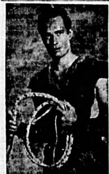
CHARLTON HESTON stars in "Ben-Hur" coming to the MovieLand Drive-In Nov. 3 for a five day run.

American-International's "The Pit and the Pendulum," which opens at the MovieLand on Sunday, brings to the screen Edgar Allan Poe's most famous terror classic which proudly takes its place beside that studio's previous Poe tale, "The Hound of the Usher."