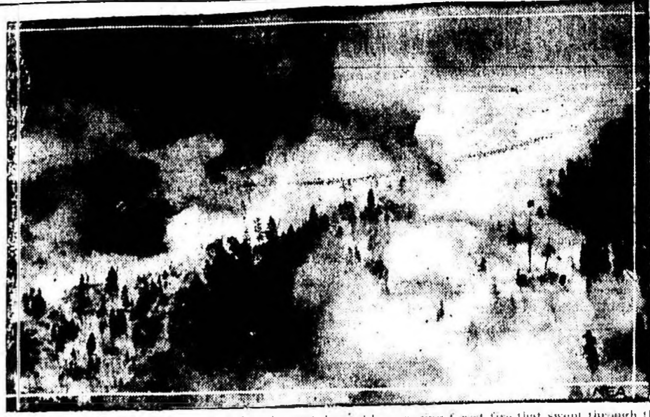
Hundreds of acres of tall pines and redwood were burned by a raging forest fire that swept through the truckee hills, California, near Lake Tahoe. This picture, one of the most remarkable pictures of a forest fire ever taken, shows the blaze at its height.