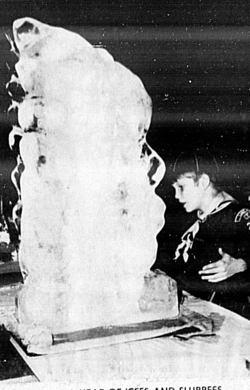
A HEAP OF ICES AND SLURPEES Cub Scout of Pack 242 of Lake Mary tries to make friends with a "feathered Indian chief" but gets only an icy stare in return. The large carving was a decoration at the annual Blue and Gold banquet held in the Lake Mary School cafeteria.