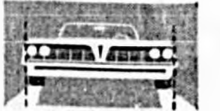
THE ONLY WIDE-TRACK CAR! Pontiac has the widest track of any car. Body width trimmed to reduce side overhang. More weight balanced between the wheels for sure-footed stability.

Powered by the new, fuel-saving Trophy V-8 Engine! New fuel induction system gives this new free-breathing engine more air, makes gas go further. Eleven versions to select from. Horsepowers range from 215 to 348. For best economy you can specify the dollar-saving Trophy Economy V-8. Its lower compression ratio lets you use regular gas. Add it all up... it's the Wide-Track way to travel! Try it!