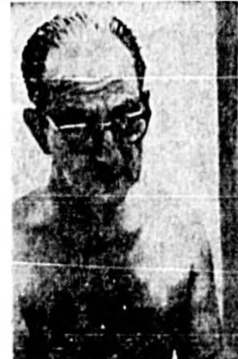
LEON BLANCO , Cuban consul at Miami has returned to Cuba on a beating given him by anti-Castro protesters of firing squad deaths.

Fifteen of the men were political prisoners at La Cabana prison at Morro Castle. The other six were guards who had helped them escape and joined them in their flight Oct. 7. They said they hid in the houses of anti-Castro sympathizers after their escape.