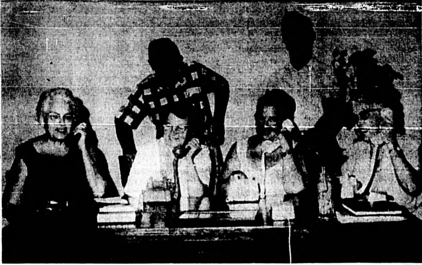
SOUTHERN BELL TURNED OVER FACILITIES Saturday to the Sanford-Delary Entertainment Assn. for solicitation of memberships for the upcoming concert season. This is the group's membership drive week and an office is open at 104 S. Park Ave. to enroll members.

OL 53 United Press Leased Wire Established 1908 MONDAY, OCTOBER 17, 1960 SANFORD, FLORIDA NO. 41