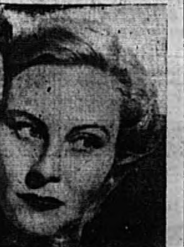
"SWEETHEARTS!" Robert Cummings and Michele Morgan in a scene from "The Chase," with Steve Cochran and Peter Lorre. Playing Thursday and Friday at the Rita.