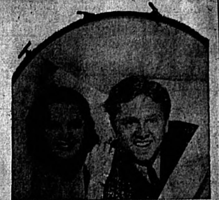
JUDY GARLAND and Mickey Rooney, tremendously popular locally as well as nationally, will be seen in one of their biggest successes, "Strike Up the Band" when it makes a return show here next Tuesday at the Ritz as part of a bargain day program.