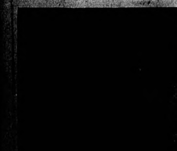
FRANK BUCK'S "Jungle Cay" is the greatest wild animal picture ever made. Also "March of Time presents 'Thumbs Up, Texas!'"—Added—Cartoon and Universal News.