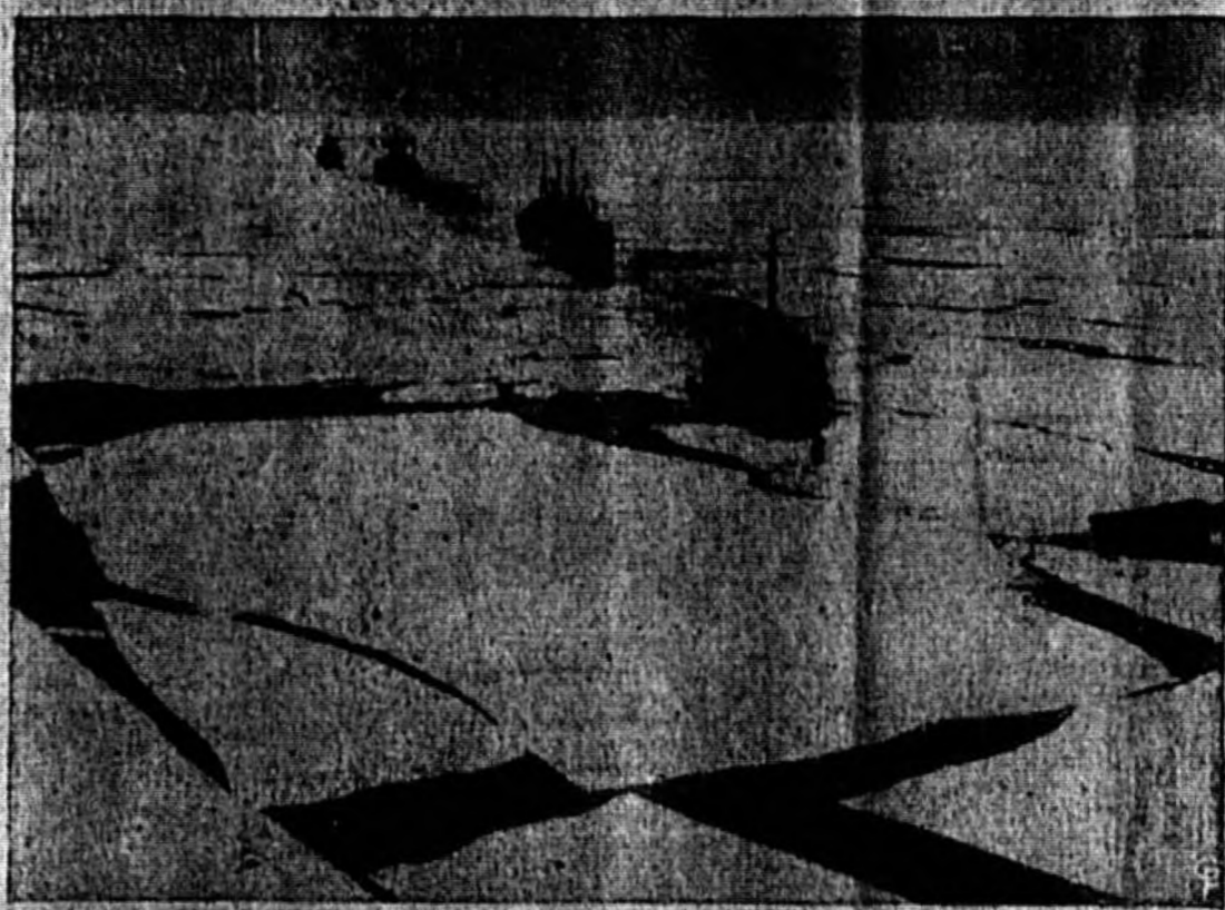
IN THE WAKE OF THE ICE BREAKER Northwest, the Central Group of the Navy Antarctic expedition pushes through the huge chunks of polar ice on its way to a mooring site. The expedition's commander, Adm. Richard E. Byrd, has now ordered final evacuation of Little America to escape the deadly encroachment of the ice belt which began tightening on the Central Group of Operation High Jump.