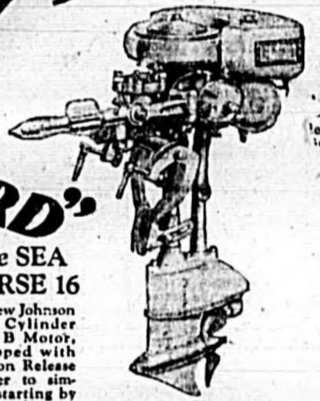
The SEA HORSE 16

Go around and see this wonderful motor in the Johnson dealer window at the address below. See what a wow it is! Ask all about it. Then come around and see us and we'll tell you how to win it! C'mon, let's go!