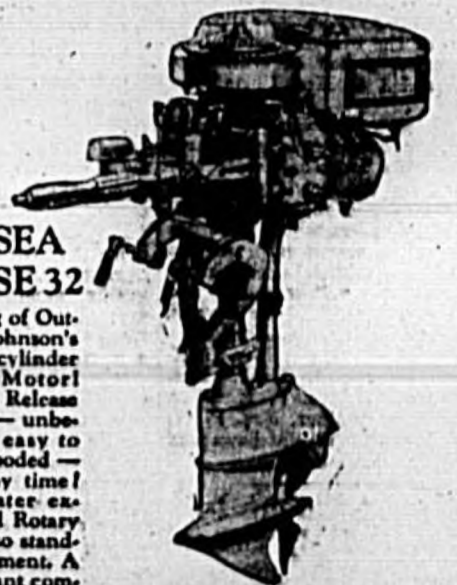
The SEA HORSE 32

The new Johnson Twin Cylinder Class B Motor, Equipped with Johnson Release Charger to simplify starting by releasing the compression from one cylinder and supercharging and doubling the spark intensity in the other. Also has the Johnson Underwater Exhaust which does away with all gas fumes in boat and eliminates the noise of the exhaust, leaving only reassuring whir of sweet running motor. Another new refinement, the Johnson Rotary Valve, which permits full gas charges into cylinders at high engine speeds—thus giving greater power and speed.