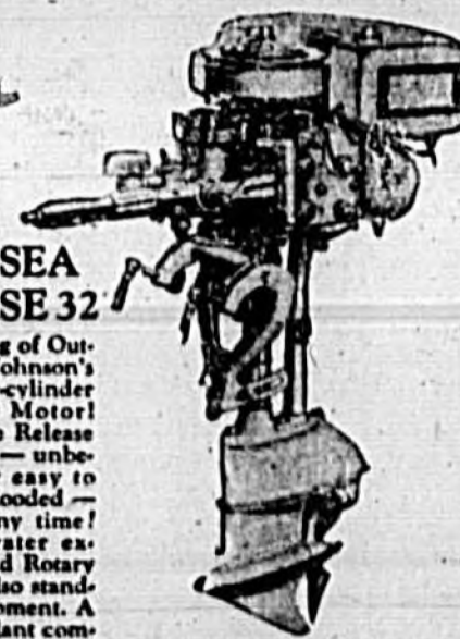
The SEA HORSE 32

The new Johnson Twin Cylinder Class B Motor. Equipped with Johnson Release Charger to simplify starting by releasing the compression from one cylinder and supercharging and doubling the spark intensity in the other. Also has the Johnson Underwater Exhaust which does away with all gas fumes in boat and eliminates the noise of the exhaust, leaving only reassuring whir of sweet running motor. Another new refinement, the Johnson Rotary Valve, which permits full gas charges into cylinders at high engine speeds—thus giving greater power and speed.