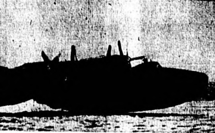
CHURNING THROUGH THE WATERS of San Diego Bay, Calif., is the Navy's new flying boat, the XP5Y-1. The 48-ft-long flying boat is designed for long-range search and rescue missions, weighing 80 tons, the sea giant has four P40 engines, each with contra-rotating propellers.