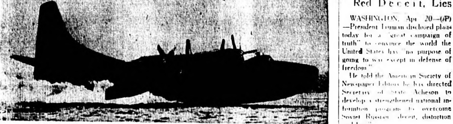
CHURNING THROUGH THE WATERS of San Diego Bay, Calif., is the Navy's new flying boat, the XP5Y-1. The 48-ft-long flying boat is designed for long-range search and rescue missions, weighing 80 tons, the sea giant has four P40 engines, each with contra-rotating propellers.

U. S. Navy's New Sea Giant In First Test