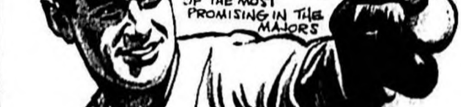
HOOPER IS THE ONLY SHORTSTOP THE TIGERS HAVE BUT THEY'RE NOT WORRYING

DETROIT ROOKIE SHORTSTOP ONE OF THE MOST PROMISING IN THE MAJORS