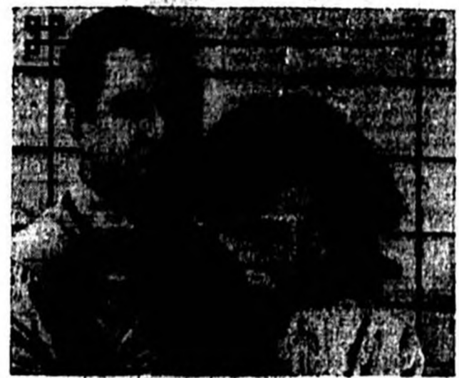
Bill Fargo (Johnny Mack Brown) and Linda (Jeanne Kelly) watch the mob intent on lynching Bill for a framed-up murder, in "Fighting Bill Fargo". Part of a fine double-bill program continuing to the Ritz, Friday and Saturday.