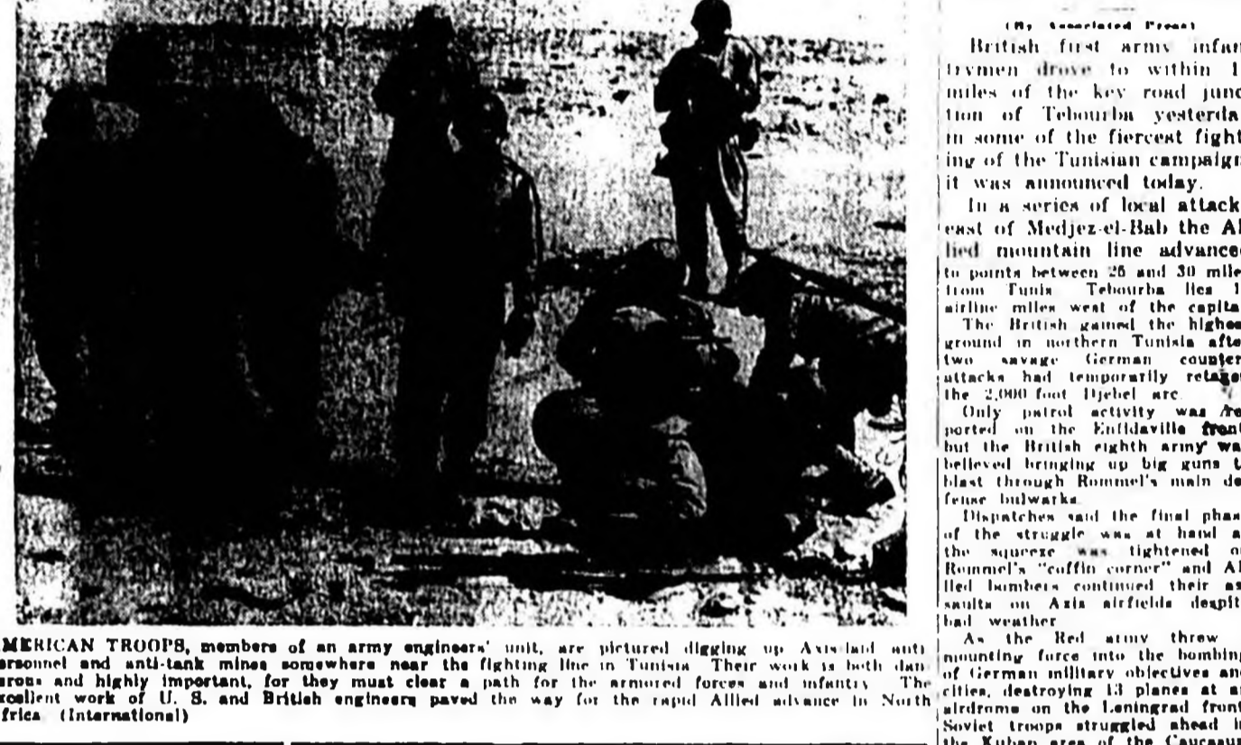
AMERICAN TROOPS, members of an army engineers' unit, are pictured digging up Axis land anti-personnel and anti-tank mines somewhere near the fighting line in Tunisia...

U. S. Troops Dig Up Axis Mines In Tunisia