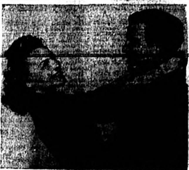
Elyse Knox and Don Terry find romance in their latest picture, "Top Sergeant", featured with Lee Carrillo and Andy Devine, at the Ritz Friday and Saturday.

Quality liquor that even the Navy can serve proudly. ARCADE Package Store ALL POPULAR BRANDS Mather Bldg. Phone 9148