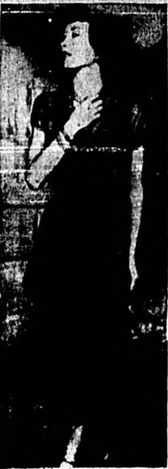
TIRED PATIO DRESS—Pleated tiered, patio strapless dress of lavender and gold striped cotton, worn with a pale lavender cool jersey bolero jacket, from the collection of a New York designer.