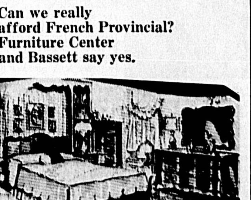
PANEL BED $49.95 4-DRAWER CHEST $79.95 DOUBLE DRESSER & MIRROR $139.95 FURNITURE CENTER 1100 S. FRENCH AVE. SANFORD, FLORIDA