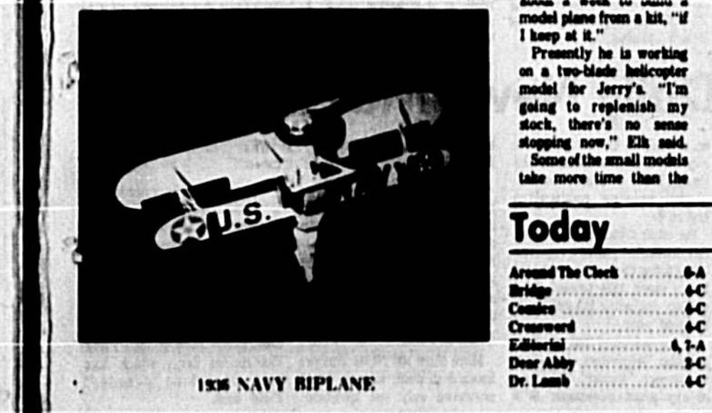
1936 NAVY BIPLANE