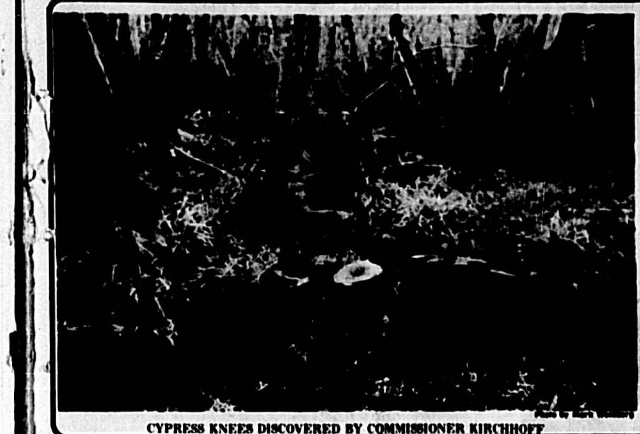
CYPRESS KNEES DISCOVERED BY COMMISSIONER KIRCHHOFF