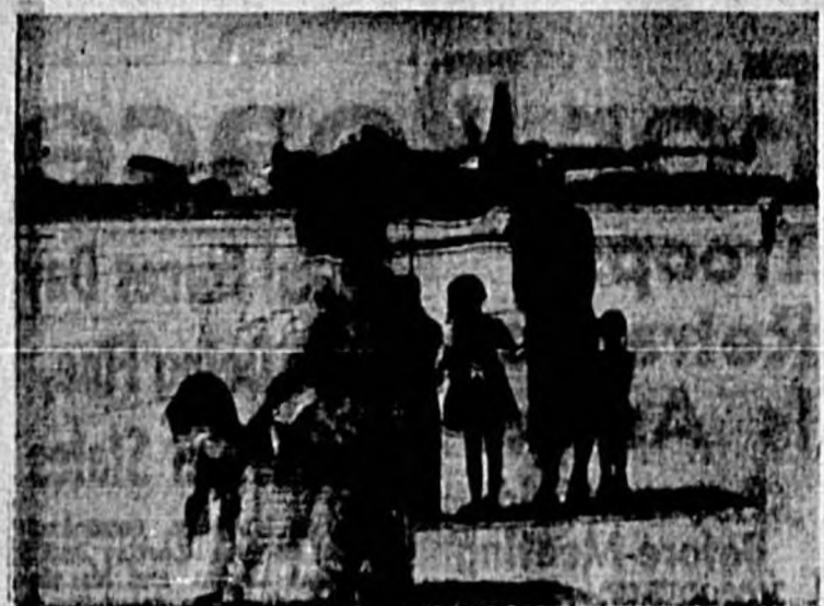
'THERE GOES DADDY!'—Wives and children of VJ-62's Detachment "Love" personnel look on as one of the detachments AJ-2P aircraft taxis to the NAAS Sanford runway to take off on the first leg of their five thousand mile trip to an overseas base. The detachment departed Monday May 9 for a six month photographic mission.