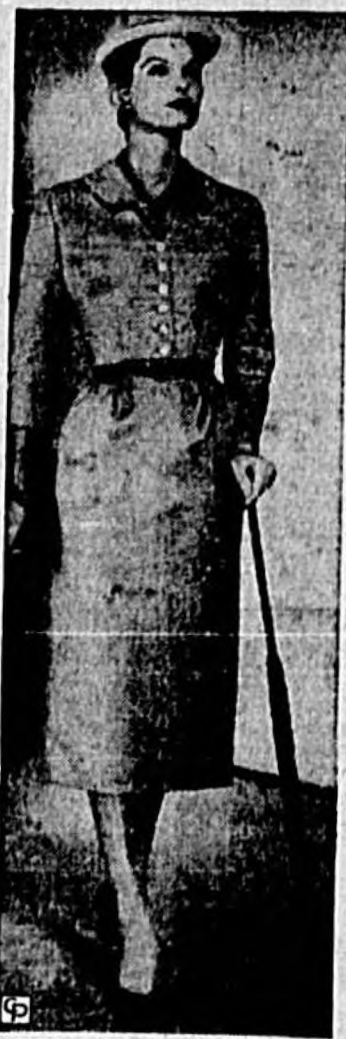
TWO-PIECE COSTUME of caramel colored textured silk, was designed by Mollie Parnia. The rounded collar, attached to the short-sleeved dress, is V-d into the collarless neckling of the jacket. A tan pigskin belt and a red and black printed silk scarf go along. Sally Victor hat.

Yogurt — a cultured milk of custard consistency — is delicious served over frozen peaches thawed but still frosty.