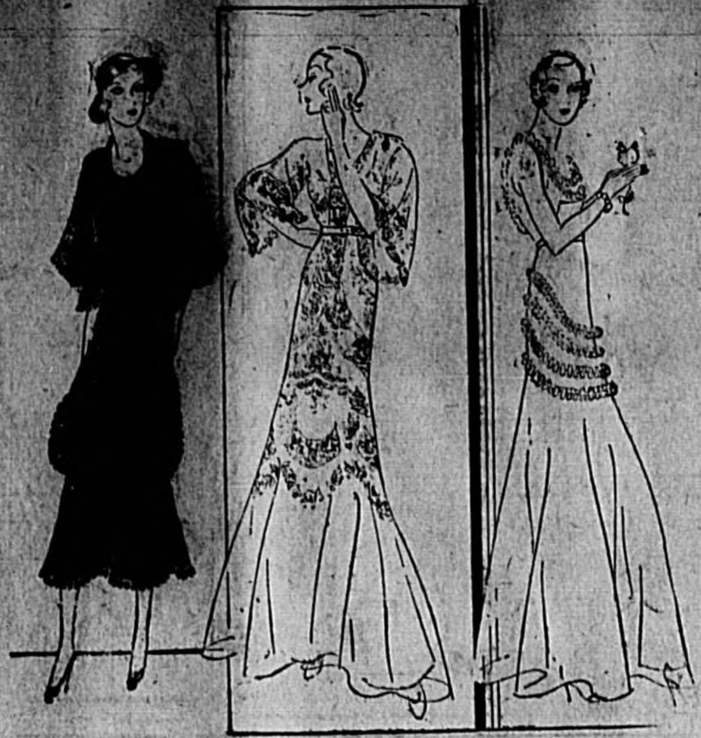
The little costume at left developed in red chiffon printed in small scattered flower design, introduces an apron encrusted to the bodice; the jacket and other edges are finished with pleated ruffles.