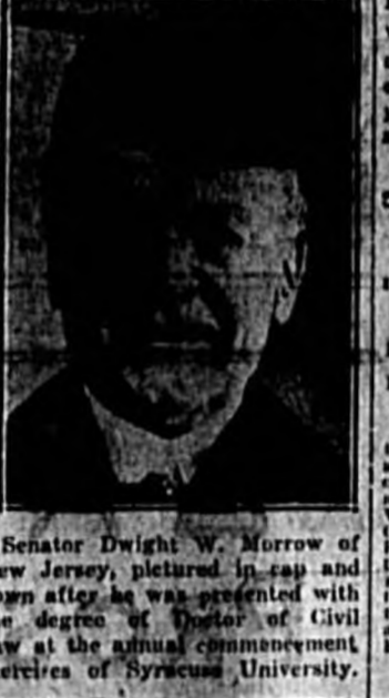
Senator Dwight W. Morrow of New Jersey, pictured in cap and gown after he was presented with the degree of Doctor of Civil Law at the annual commencement exercises of Syracuse University.