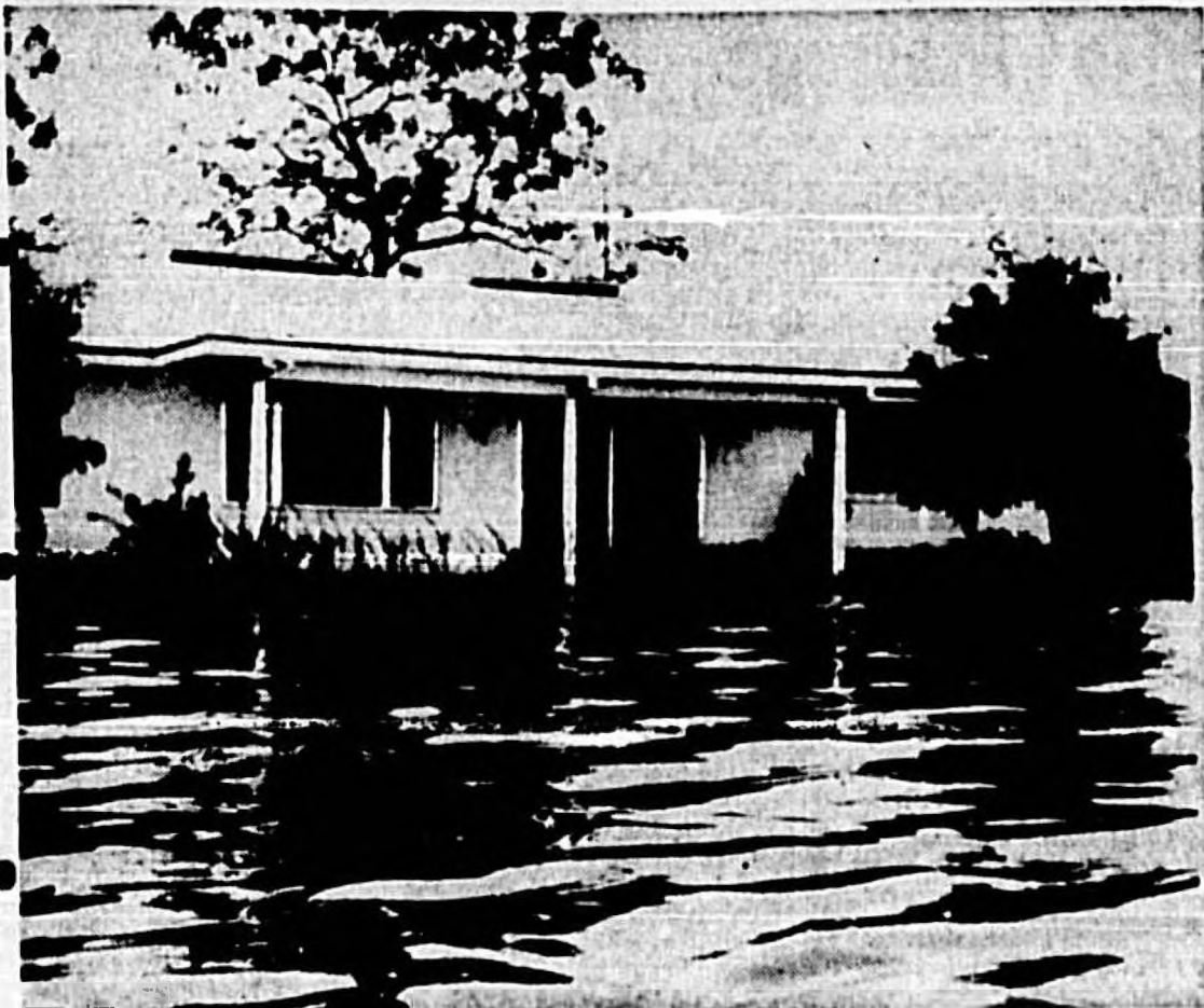
This Family Moved Out