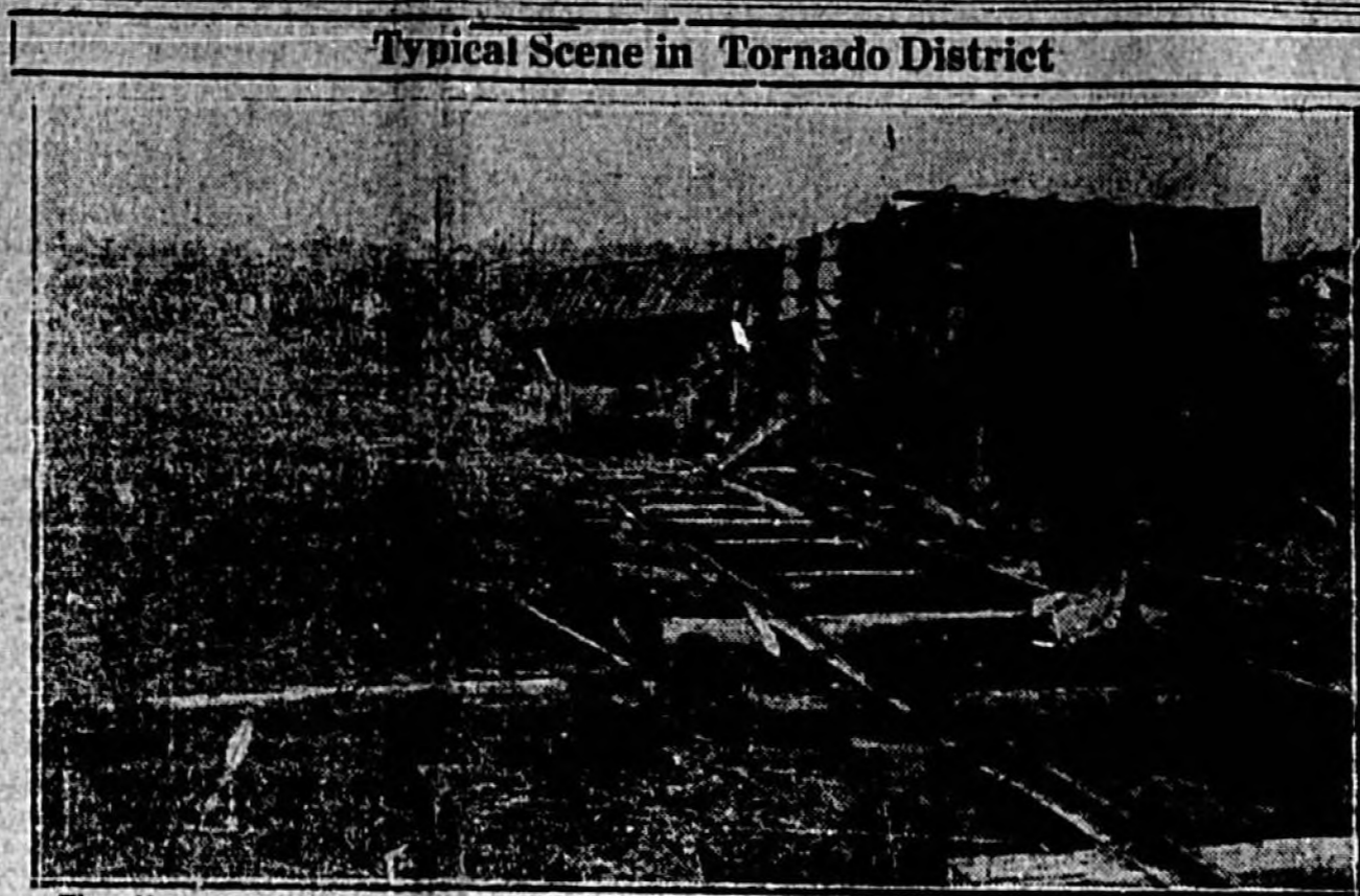
Typical Scene in Tornado District The efforts of a lifetime were smashed to bits by the tornado which crushed in houses like so many eggshells and left a trail of wealth and havoc in its wake. This picture, taken at Murphysboro, Ill., one of the towns hardest hit by the twister, gives some concept of the tornado's fury. Note the solid concrete lions and hurled far and wide.