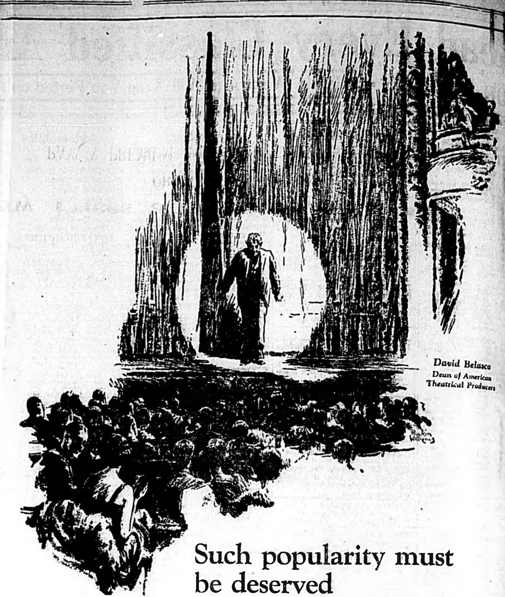
David Belasco Dean of American Theatrical Producers