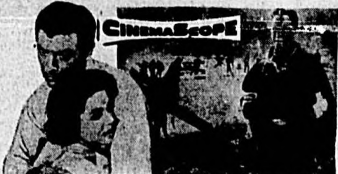
LOVE AND WAR... D-DAY The Sixth of June playing Sunday and Monday at Prairie Lake. Starring Robert Taylor, Dana Wynters, Richard Todd and Edmond O'Brien.

HOOVER RADIO & TV SERVICE City Radios A Specialty PHONE 7833 503 S. SANFORD AVE.