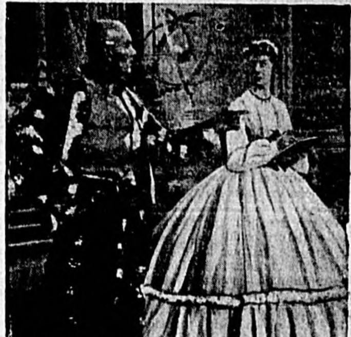
"THE KING AND I" begins Sunday and plays through Tuesday at the RITZ THEATRE, starring Yul Brynner and Deborah Kerr.

Deborah Kerr is Anna, the teacher of the King's 106 children. As she explained to Anna, he had only that many children because "I haven't been married very long." Vying for honors in this picture are the color and the music of Rodgers and Hammerstein.