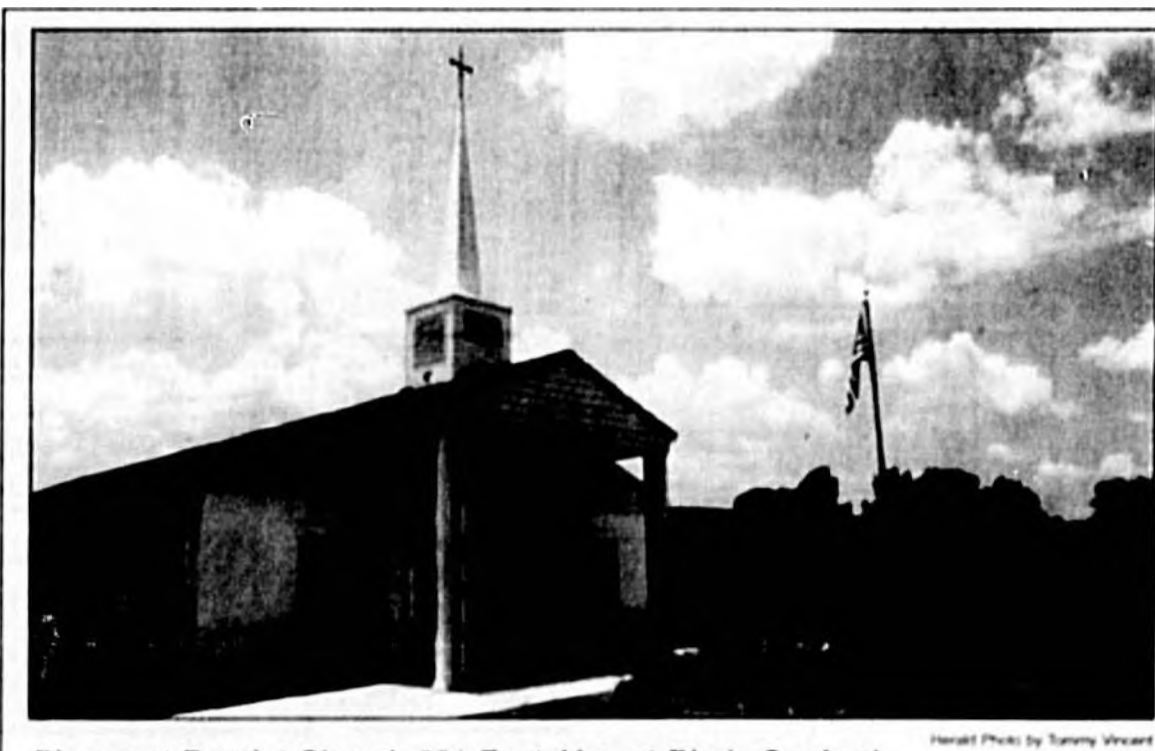
Pinecrest Baptist Church 601 East Airport Blvd., Sanford.