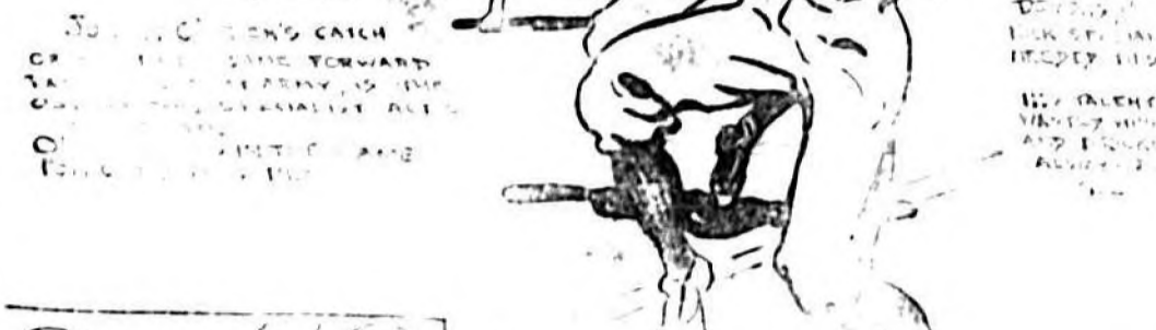
Illustration of a basketball player in mid-air, performing a jump shot.