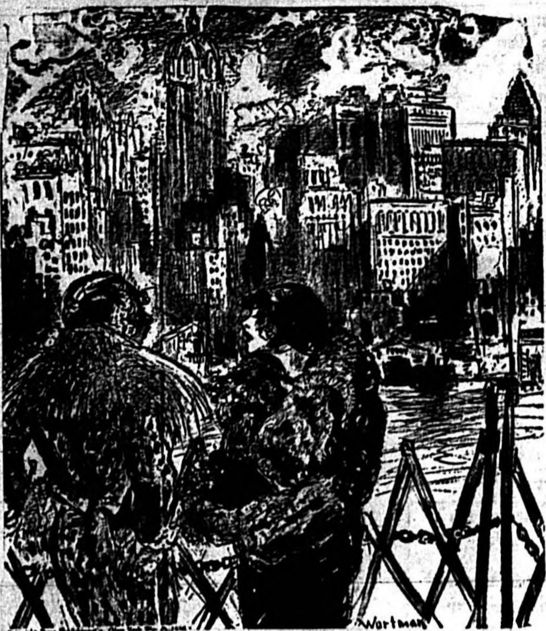
"What are you changing it for? Your real name is swell for the movies." "Too long. I've got to think how it'll be in the lights."