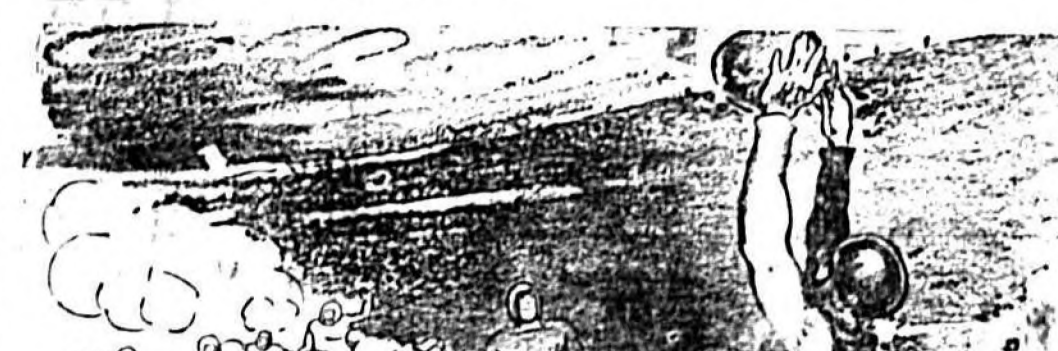
Illustration of a football game in progress, showing players running with the ball.