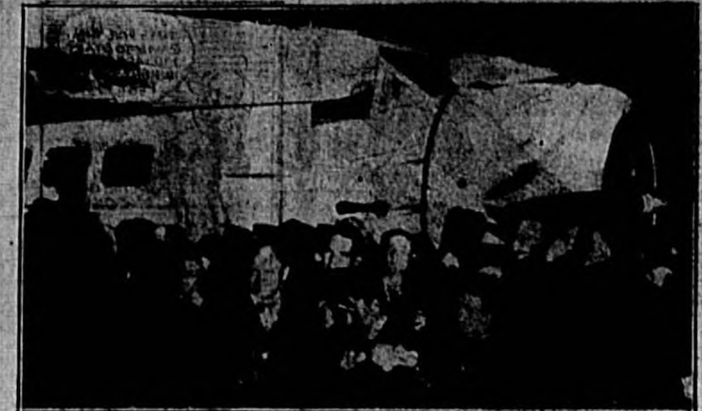
This picture, telephoned from Berlin to London to catch a fast and Harold Gatty upon their arrival in Berlin on the fourth lap in their round-the-world flight. Despite the speed of the picture's transmission, the flyers were due in New York a few hours after it was delivered.