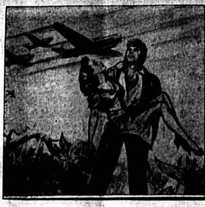
"Flight Lieutenant," stirring story of the men who test our planes to bomb the Axis, which will be the feature attraction at the Ritz, Sunday and Monday. An "Our Gals" comedy, a Donald Duck Cartoon and a new issue of Metro News are also programmed.