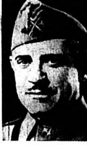
Gen. Francisco Franco, Chief of the Spanish State, is the only full-fledged ally of the Axis powers and Spain might join the Axis if Hitler and Mussolini succeed in their efforts to conquer the British Empire.