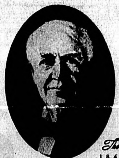
Thomas A. Edison 1847...1931

"When the Government goes into business, it can always shift its losses to the taxpayers. If it goes into the power business, it can pretend to sell cheap power, and then cover up its losses."