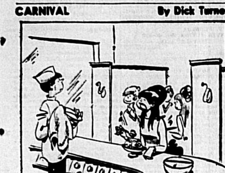
"Daddy really does go all out trying to communicate! He's even learning our language!"