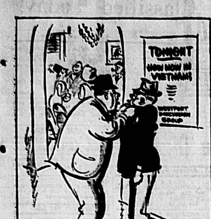
"Say "Negotiate" "