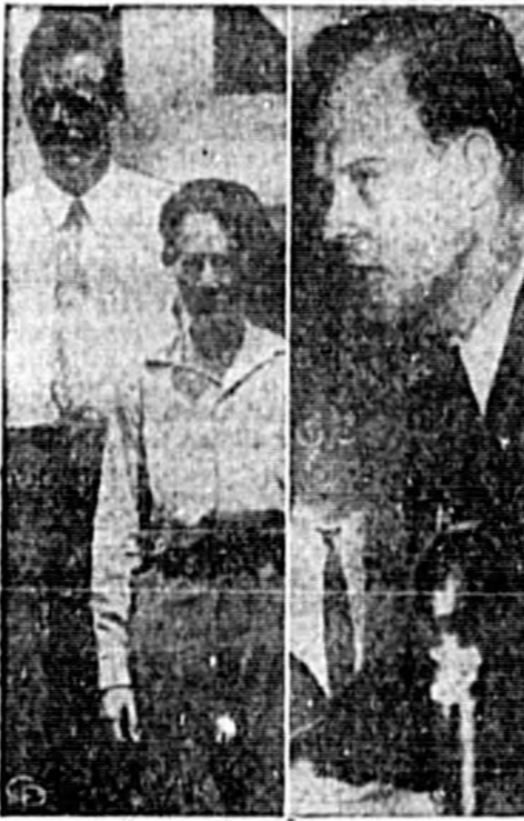
Lindbergh and his wife Anne.