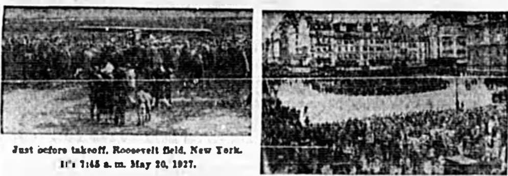
Just before takeoff, Roosevelt Field, New York. It's 1:45 a. m. May 20, 1927.