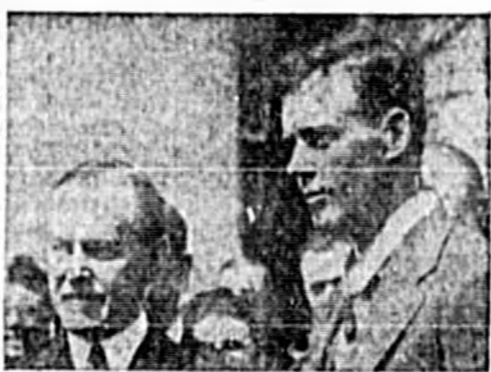
President Calvin Coolidge and Lindy as he presented the flyer with Medal of Honor.

MAY 20 is the 30th anniversary of the historic solo flight of Charles A. Lindbergh from New York to Paris, and you can go all the way back to the Wright brothers at Kitty Hawk and not find an airplane deed which got more attention. These photos take you back to that 1927 day.