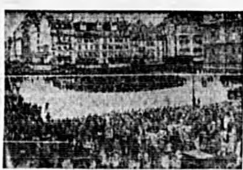
Cheering through Jans square in front of Paris city hall as Lindbergh is honored.