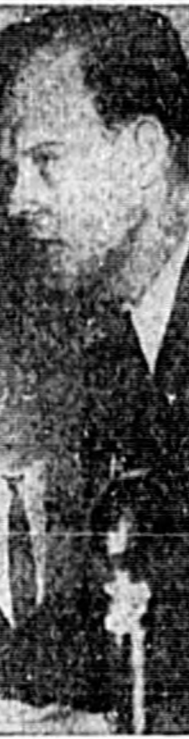
America's first speaker, 1941.