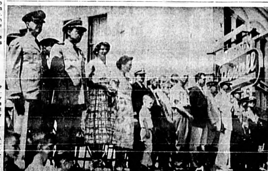
FROM THE REVIEWING STAND located across Magnolia Ave. on First St., officials and guests watched Saturday's Armed Forces Day Parade as Sanford's "show of strength" in the mammoth review pass by.