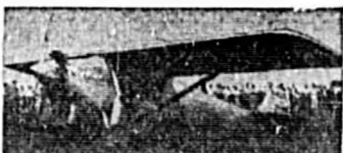
Here is Lindy's "Spirit of St. Louis" as it was being readied for the flight.