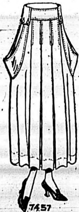
A four-piece skirt in gabardine with plaited front and back and gathered sides. The pockets may be omitted, if desired.

A skirt that has met with unusual success is this four-piece design in plaited effect. The side gores are gathered at the top, while the front and back are plaited. The adjustment is to the left of center-front under a plait. If desired, the pockets may be omitted. In medium size the design requires 4 1/2 yards 44-inch material. If made without the pockets, 3 1/2 yards will be sufficient.