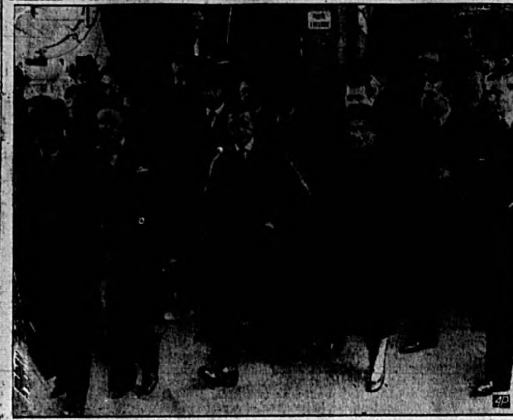
The Duke and Duchess of Windsor, for which he renounced the throne of England, are pictured here in a crowd at a Paris railroad station shortly before he postponed his scheduled tour of America "because his motives were misunderstood." The Duke and Duchess may yet visit America early in the New Year.