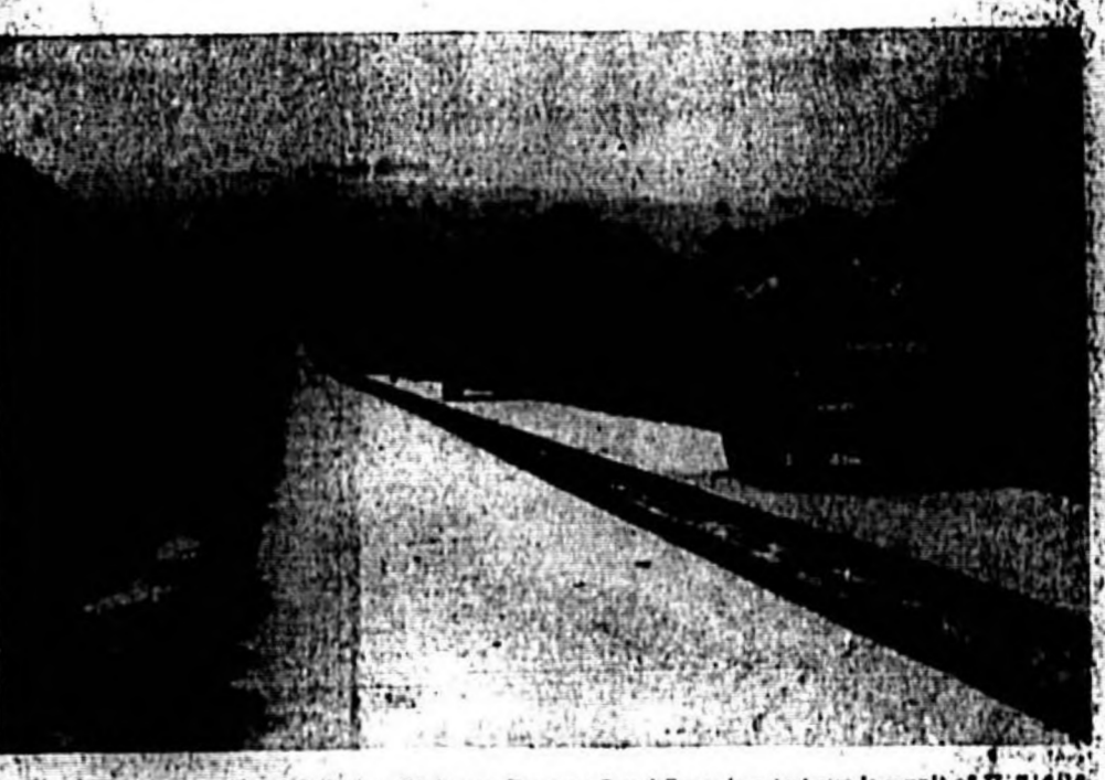
Racing over the new Trans-Isthmian Highway, Panama Canal Zone, in a test run is a unit of U. S. Army artillery. The roadway, ripped out of thick jungle land, is 48 miles long and was completed in record time. Proving once again that a "decadent democracy" can spot the Axis a few handspans and still show them how to do things. It took the artillery unit, comprising more than 100 vehicles, just three hours to drive the crossing despite heavy tropical rains. The highway will facilitate speedy movement of troops and equipment from one end of the canal to the other.