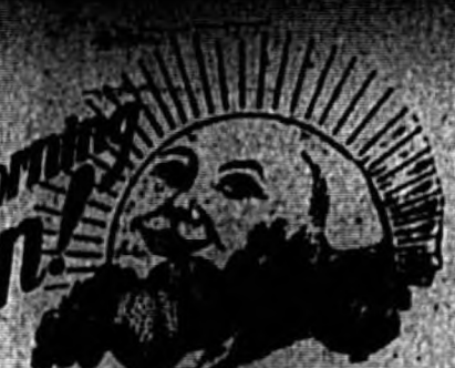
Table Supply Vegetables Fresh as The Morning Sun!

Fancy Lettuce LETTUCE head 3 1/2c Yellow Squash 7 1/2c Beans 9 1/2c