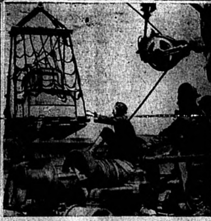
Learning the tricks of the maritime trade is this group of soldiers at Fort Hamilton, N. Y. Part of the work of the Quartermaster Corps requires the loading and unloading of ships, and these men will be assigned to such work as soon as they complete training on the U. S. S. Midway, the named the men have given the ship that never goes to sea. They are depicted operating winches. Note barracks in the background.