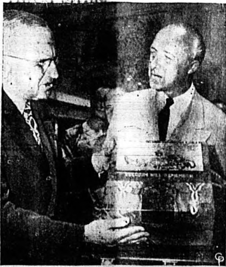
PRESIDENT HARRY S. TRUMAN accepts in Washington from Baron Robert Silvercrans, Belgian Ambassador to the United States, an urn containing earth from the Belgian battlefield of Bastogne. The urn was in a mahogany box which bore the following legend: "In honor of the U. S. Armed Forces..."

LIGHTS GO ON GLASGOW, (AP)—Glasgow has restored street lighting, reduced as a fuel conservation measure, because crime increased under blackout conditions.