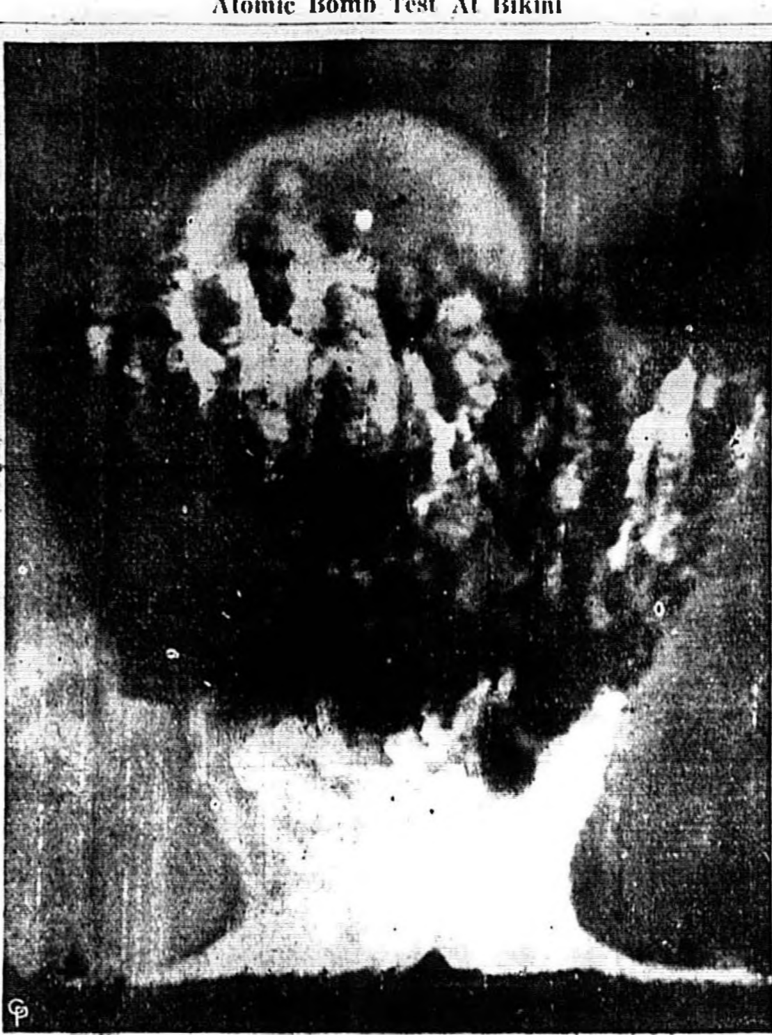
THIS BOMB WAS EXPLODED AT BIKINI WATER, JULY 26, 1946. The atomic bomb in "Fat Man" is exploded beneath the water in Bikini Lagoon. A large ball of molten lava is being thrown into the air by the explosion. The photo was taken from the ship "USS Albatross" which was 11 miles from the blast center.