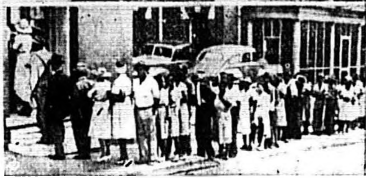
ENTHUSIASTIC FOLLOWERS "chair" Eugene Talmadge (top) in Atlanta, Ga., as early returns in Georgia Democratic primary election indicate that he is leading. Pictured below, Negro voters stand outside the Cobb County Courthouse in Marietta starting to cast their votes for the first time in the history of the state of Georgia.