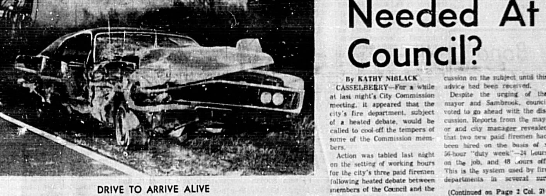
DRIVE TO ARRIVE ALIVE