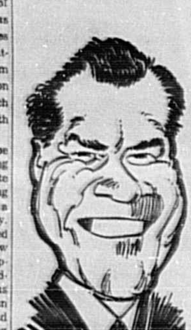
Richard M. Nixon