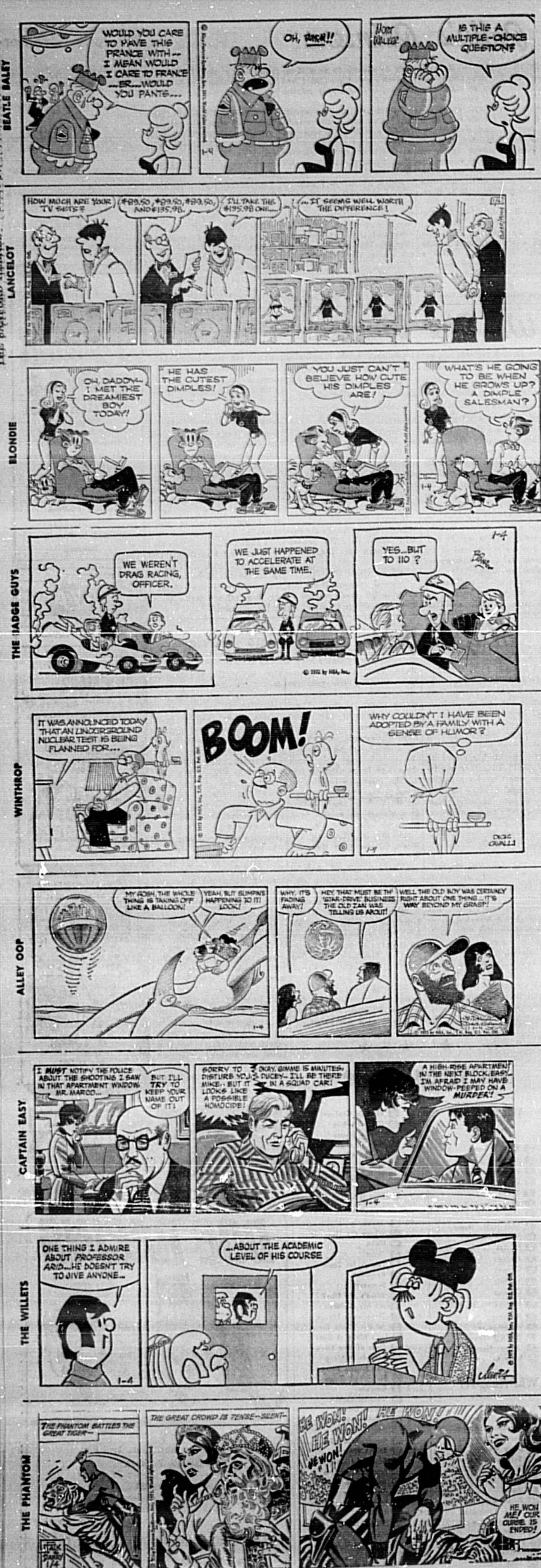
THE SAN FRANCISCO HERALD, Monday, January 13, 1973 - Page 1 BEATLE BALLY LANCELOT BLONDIE WINTHROP ALLEY OOP CAPTAIN EAST THE WILLETS THE PHANTOM