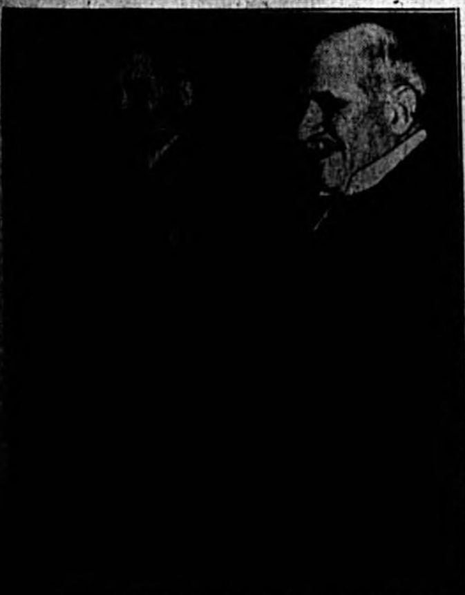
... Morgan, in high ...