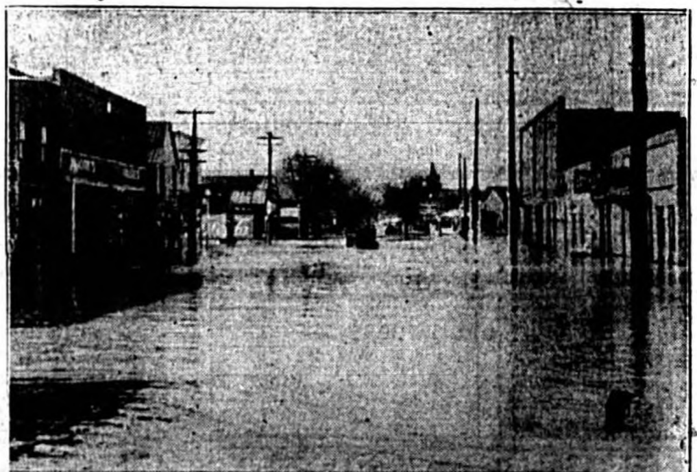
Refugees estimated at 1,500 to 2,000 fled their homes in low-lying sections of Nemo, Ga., as high waters from the Etowah and Oostanaula rivers flooded wide areas. Water that came half way over the tops of automobiles is shown in one of the streets near the river front.